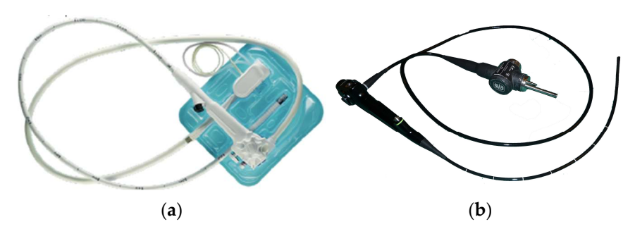
Figure 6. Images of ( a ) single-use endoscope (personal collection), and ( b ) reusable endoscope (per CC BY-SA, [69]).

Sustainability 2023 , 15, 15872 11 of 17