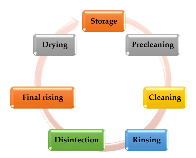
Figure 3. Disinfection scheme and stages of the endoscopes.