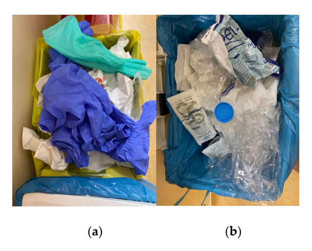
Figure 5. (a,b). Pictures from the authors' endoscopy unit with different types of waste (personal collection).

If the types of materials are analysed, the majority of endoscopy materials and subsequently endoscopy waste are composed of plastic, followed by mixed materials (plastic and metals), only metals, and other materials (cotton, fabric, paper) as seen in the pictures below (Figure 5a,b).