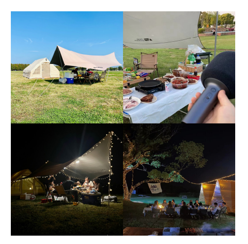
Figure 1. Example of a glamping picture.