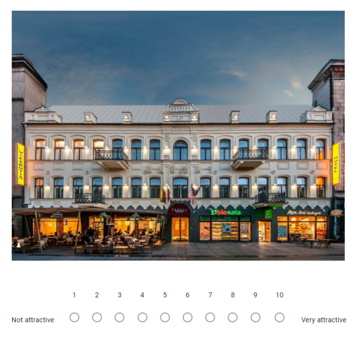
Figure 2. Sample sheet of the social survey regarding attractiveness.

On a scale of 1 to 10, how attractive is this building?