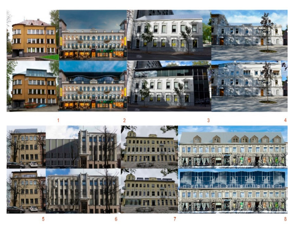
Figure 1. Presented photographs with the sample numbers below. Each column demonstrates before and after version of a building with its sample number.

The buildings for the experiment were selected according to the following criteria: