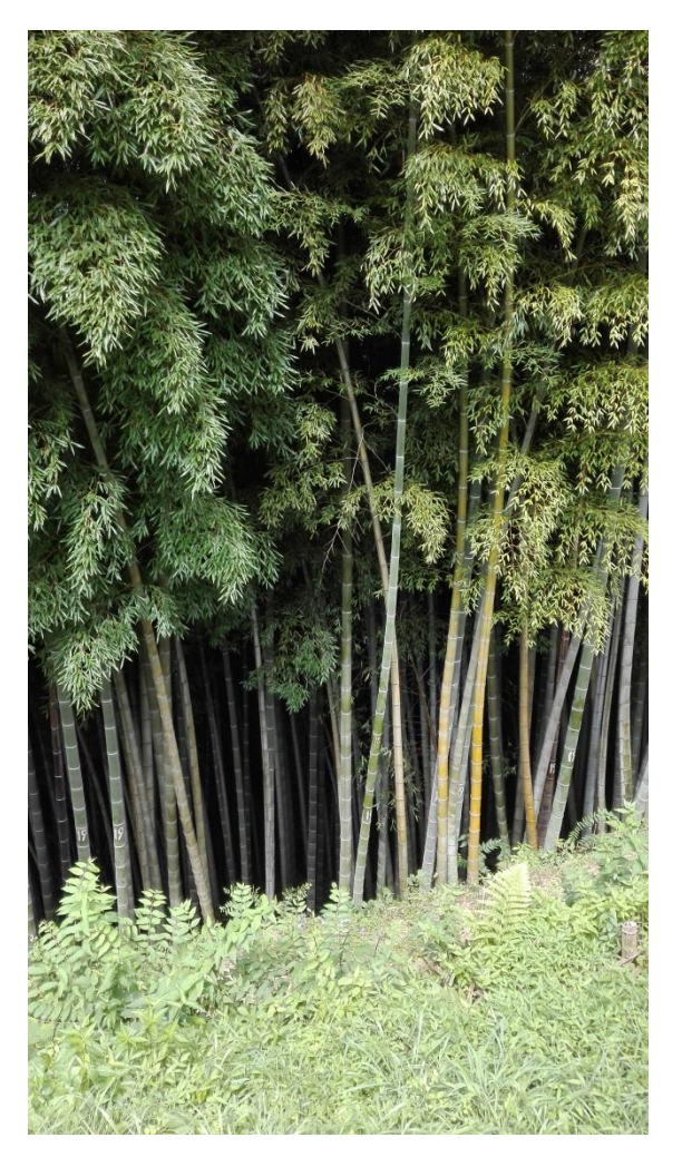
Figure 2. Bamboo (Phyllostachys pubescens Moso Bamboo) forest in Batumi (Georgia, Caucasus).

timbers. Bamboo material can be used for almost all elements of construction and home furnishing, including poles supporting ceilings or roofs, or as elements of walls and floors. Bamboo may be substituted for wood in many industrial adhibitions and thereupon contribute to the restoration and saving of the world's forests. For example, in architecture, panels and boards made of bamboo are characterized by high hardness and are abrasion-resistant; they are also classified as durable materials and able to replace more expensive hardwood products. Bamboo can also be used as beams and trusses. Adding bamboo to cement has been reported as strengthening concrete structures, with great potential for the mass construction of inexpensive dwellings or as an excellent material for building structures with great resiliency to earthquakes and landslides [38].