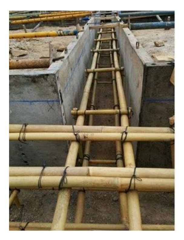
Figure 4. Bamboo in replacement for steel reinforcement.

lignin, cellulose, and hemi-cellulose, amounting for over 90% of the total mass. The minor constituents of bamboo are resins, tannins, waxes, and inorganic salts. Compared to wood, bamboo has a higher content of alkaline extracts, ash, and silica [30]. The major ash-forming constituents from bamboo are potassium ( K_2O ) and silica ( SiO_2 ). It also contains chlorine (CI), calcium (CaO), and magnesium (MgO). To evaluate the quality of biofuels, it is essential to have knowledge of the contents of chlorine (CI) and sulphur (S). A high amount of these elements provokes corrosion and contamination of boilers, pipes, and guide wires and increases emissions of SOx, CI_2 , and HCI [47]. Due to its specific chemical composition, bamboo is resistant to attacks from fungi, mould, and borers [48].