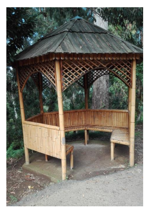
Figure 6. Bamboo gazebo in a garden in Batumi (2019).