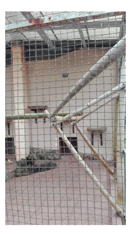
Figure 7. Bamboo elements in enclosure for animals (Batumi 2019).