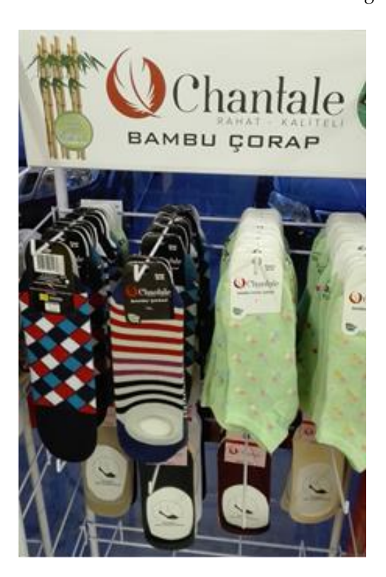
Figure 5. Bamboo socks in a Turkish shop (Artvin 2019).

destructive practices. Several bamboo products, including sanitary sticks, bamboo brooms, and bamboo fans, have become a daily need for a wide range of people [57]. Bamboo timbers are luxury woody materials widely used in furniture and flooring [11]; they are also the most suitable materials for building development and bridge construction due to their microstructural and mechanical strength [58].