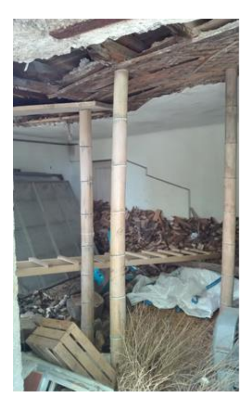
Figure 3. Ceiling support (Batumi 2019).

Due to the presented properties in the Table 1, bamboo is widely used in construction. Figures 3 and 4 show examples of bamboo serving as a pole supporting the ceiling and elements in strengthening the foundations.