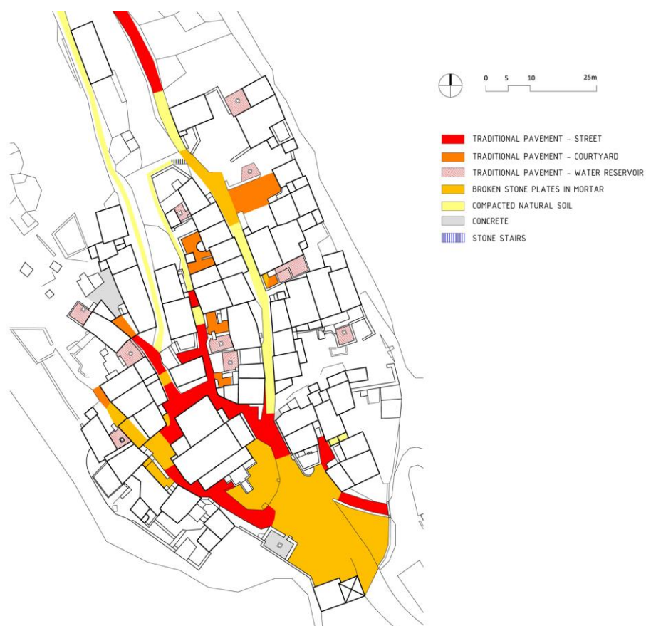
Figure 14. Public and semi-public space pavement types. Map by the authors.

The streets are characterized by the partly preserved original pavement, with broken or partially carved stone elements laid vertically and without mortar (smaller, irregular stones used for streets and larger, shaped stones for internal courtyards and terraces of external water cisterns) (Figure 15).