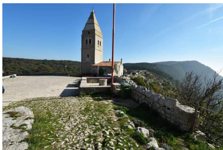
Figure 15. Fragment of original street pavement.

The streets are characterized by the partly preserved original pavement, with broken or partially carved stone elements laid vertically and without mortar (smaller, irregular stones used for streets and larger, shaped stones for internal courtyards and terraces of external water cisterns) (Figure 15).