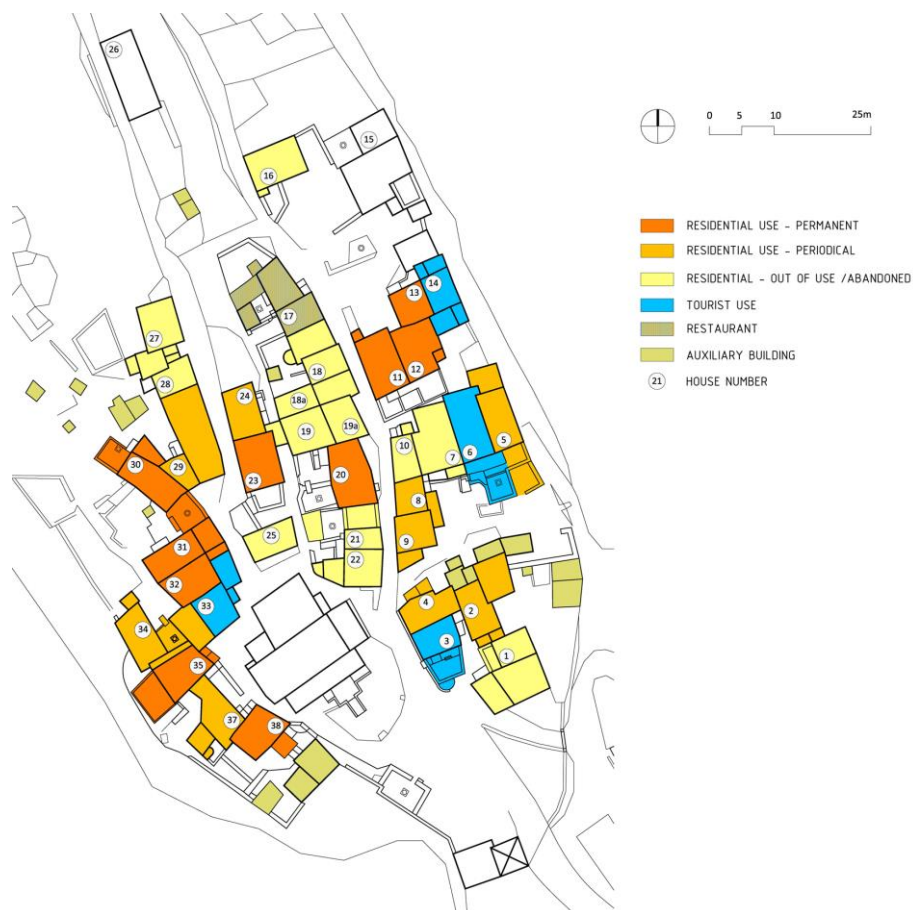
Figure 11. Current use of residential buildings. Map by the authors.

A small number of buildings are used for tourism, while the majority of the housing stock is used as permanent or periodical housing; almost half of the buildings are neglected, i.e., disused. The housing stock has a strong potential for year-round usage, not just as tourist apartments during the summer (Figure 11).