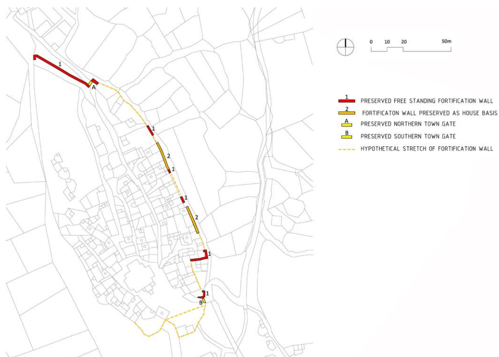
Figure 12. City fortification elements. Map by the authors.