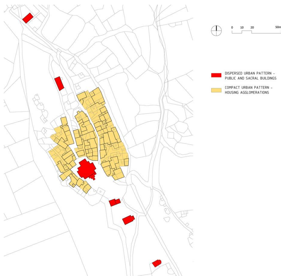
Figure 4. Urban patterns. Map by the authors.

The compact urban pattern is formed by traditional residential buildings in three linear agglomerations, spatially defined by the eastern and western perimeter of the urban fabric and by two main longitudinal streets running northwest–southeast. The residential agglomerations are characterized by a marked compactness/density (terraced and semi-detached houses), determined by the small scale of building plots and by the functional organization of buildings around internal courtyards, which creates a distinct urban pattern.