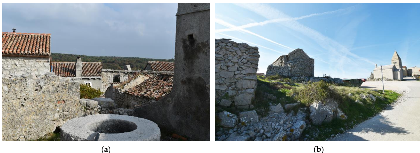
Figure 5. (a) Compact urban pattern. Photo by the authors. (b) Dispersed urban pattern. Photo by the authors.

The dispersed urban pattern is composed by public, sacral and communal buildings and public spaces in the northern and southern parts of the urban core.