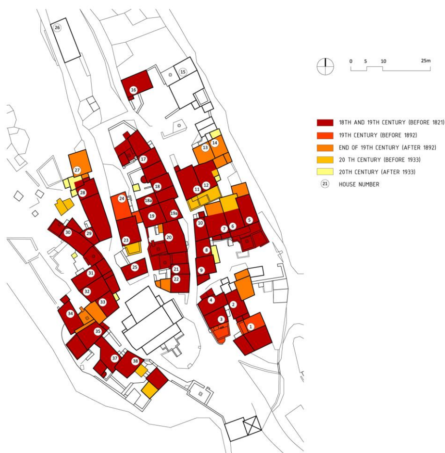
Figure 9. Construction period of residential buildings. Map by the authors.

The distinctiveness of the housing in Lubenice is expressed through an upgrade of the archetypal architectural expression by the use of elements such as impressively shaped crowns on external water cisterns, exterior staircases, prominent chimneys, wooden pergolas with stone supports over water storage terraces, stone portals and vaulted street aisles. Houses in which such building elements have been used are the most valuable examples of the housing stock (Figure 10).