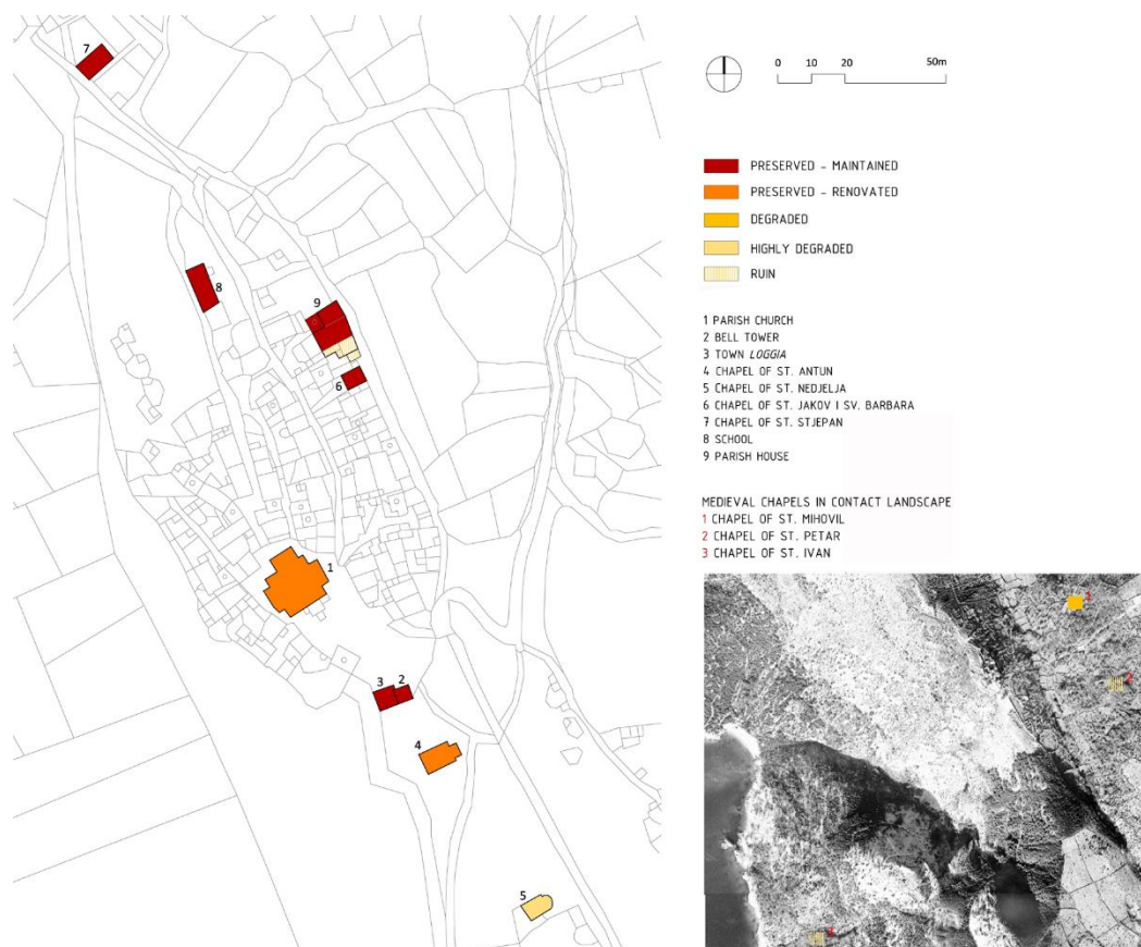
Figure 7. Condition of public and religious buildings. Map by the authors.

Chapels in the contact landscape, the bell tower and the chapel of St. Antun have been retained in their original condition. The parish church has preserved layers of historical alterations, while the school building, clergy house and chapel of St. Nedjelja have been partially altered (Figure 7).