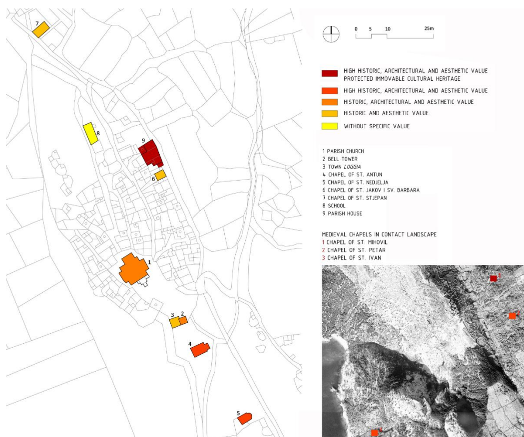
Figure 16. Evaluation of public and sacral buildings. Map by the authors.

The evaluation of architectural elements was carried out on the basis of several criteria: historical/documentary, archaeological, architectural, urban and environmental aesthetic value. According to the above criteria, in the category of public and sacral buildings, two medieval chapels in the southern part of the urban core (St. Antun and St. Nedjelja), one chapel in the contact landscape (St. Mihovil) and the clergy house complex are of high historical, architectural and environmental aesthetic value and thus have a high degree of sensitivity to change. The parish church and bell tower have historical, architectural, environmental aesthetic and symbolic value; the medieval chapels of St. Petar and St. Ivan have historical, architectural and environmental aesthetic value, while the town loggia and the chapels of St. Jakov and St. Stjepan have only environmental aesthetic value (Figure 16).