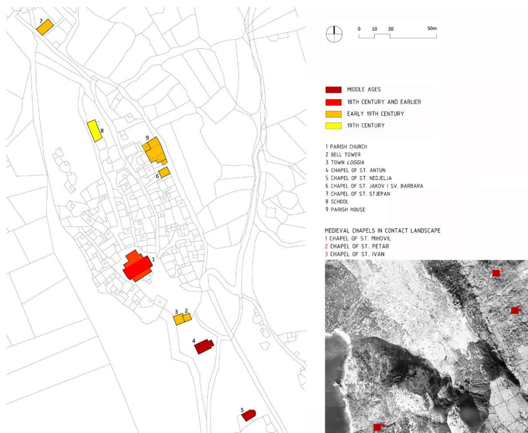
Figure 6. Construction period of public and religious buildings. Map by the authors.

Due to the variety of construction periods of individual buildings, elements of different historical architectural styles are present, from Romanesque (chapel of St. Nedjelja), Gothic (chapels of St. Antun, St. Mihovil, St. Petar and St. Ivan) and Baroque (parish church, bell tower, clergy house and chapels of St. Stjepan, St. Jakov and St. Barbara), through to the style of the 19th and early 20th century (school building) (Figure 6).