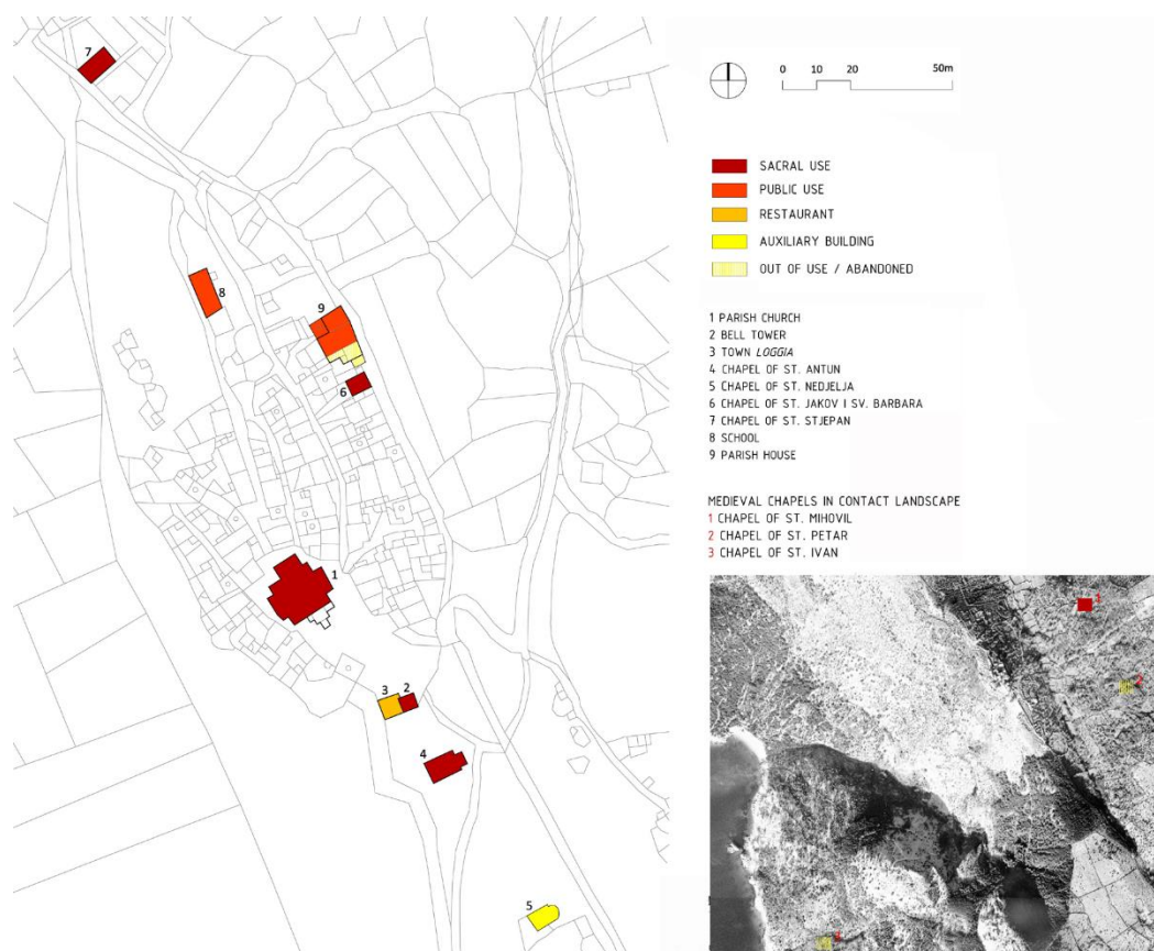
Figure 8. Current use of public and religious buildings. Map by the authors.

Residential buildings in the town's core form three linear agglomerations, with a compact urban structure characterized by semi-detached and terraced houses organized around internal courtyards. Most of the houses were built during the 18th and early 19th centuries on the basis of the archetypical house of the island of Cres, characterized by a simple rectangular floor plan, with the addition of functional external building elements such as external staircases, fireplaces and water cisterns. Houses were originally two-storied, with a room used as a cellar on the ground floor and living space on the upper floor. This has been retained in a small number of examples, while most of the houses were altered by the addition of a second floor during the 19th century. Walls were made from local broken stone, arranged in an irregular style, originally with a lime mortar finish. The principal buildings had gabled roofs, while the roofs of exterior buildings (annexes) were single-pitched. Roofs had traditional stone slate cladding and stone gutters (Figure 9).