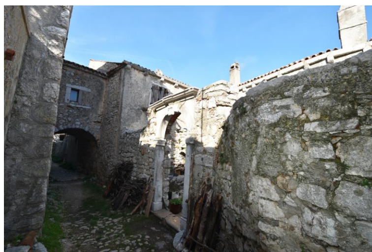
Figure 10. Stone portal and vaulted street aisle in the central housing agglomeration.

The distinctiveness of the housing in Lubenice is expressed through an upgrade of the archetypal architectural expression by the use of elements such as impressively shaped crowns on external water cisterns, exterior staircases, prominent chimneys, wooden pergolas with stone supports over water storage terraces, stone portals and vaulted street aisles. Houses in which such building elements have been used are the most valuable examples of the housing stock (Figure 10).