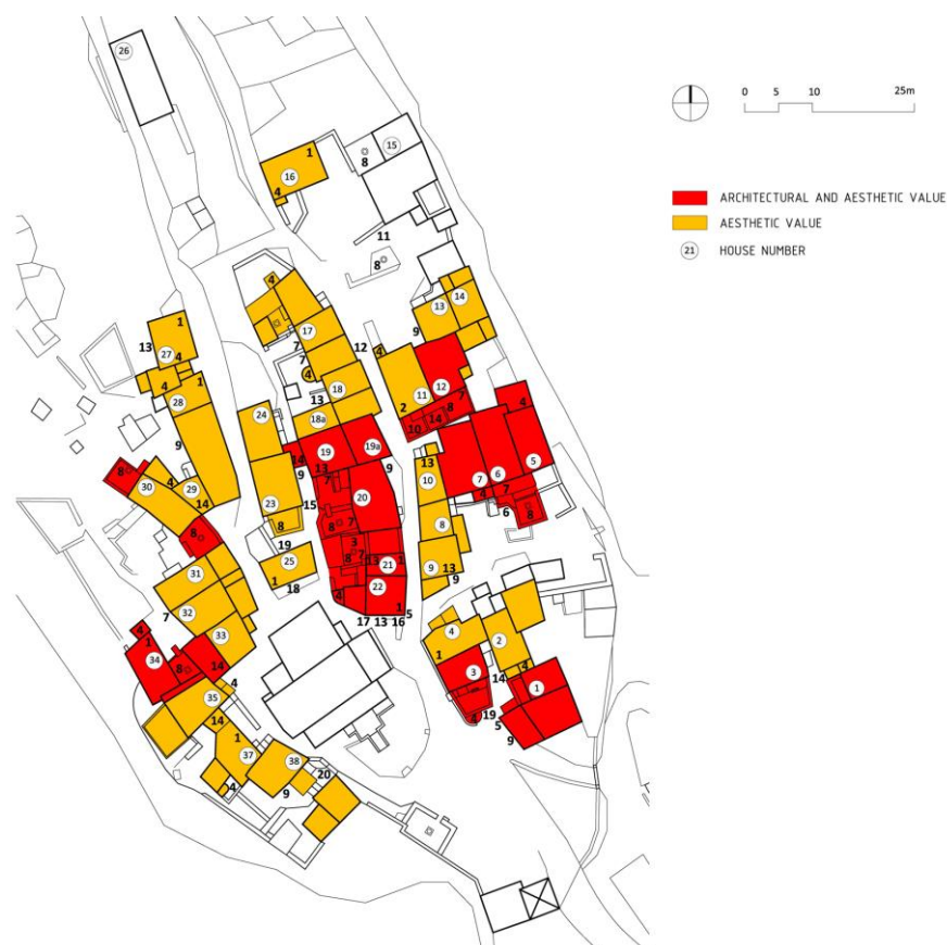
Figure 17. Evaluation of residential buildings. Map by the authors.

The preserved elements of the fortification system represent cultural and historic heritage of high historical, architectural and aesthetic value, and as such have a very high sensitivity to change.