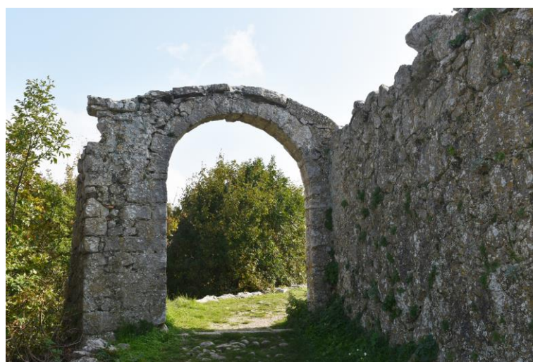
Figure 13. Part of northern city gate and medieval wall.

Lubenice public spaces comprise an access square in the southern part of the urban core, two main streets leading from the square towards the northern part of the settlement (the western street leading towards the former school building and the eastern towards the town cemetery) and a passage through the central housing agglomeration. The access square has an irregular layout, with a slight fall towards the south, and is paved with broken stone slabs laid in cement mortar, without any elements of surface drainage. A communal water cistern with a stone crown and edged with stone walls forms an integral part of the square (Figure 14).