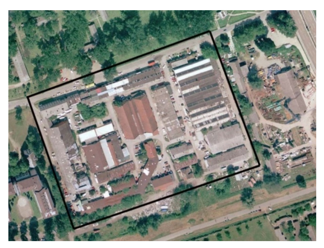
Figure 2. Aerial view of the site prior to the planned regeneration.