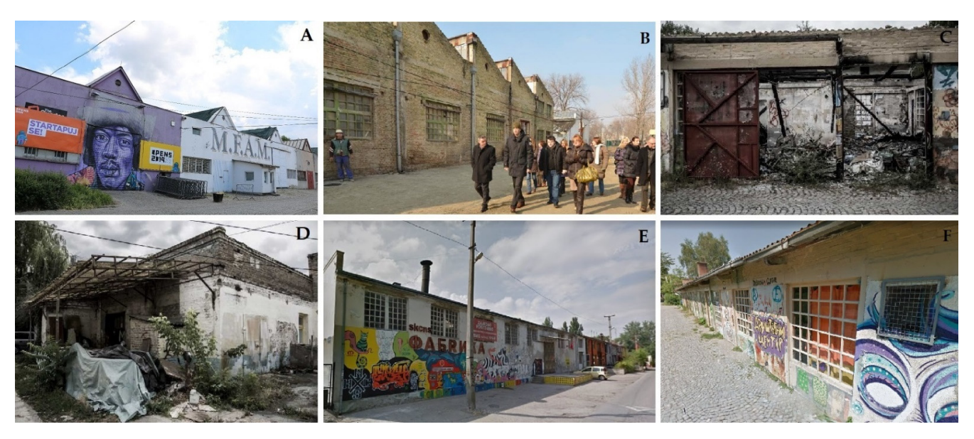
Figure 3. The uncertainty stage. (A) : the Manual Museum of Forgotten Arts (M.F.A.M.) and neighboring nightclub The Quarter. (B) : a row of buildings with a shed roof as a valuable piece of industrial heritage—artisan workshops. (C,D) : derelict warehouses. (E) : the SKCNS Fabrika. (F) : the Community Center (NGO).

Forgotten Arts (Figure 3A) and the Route 66, an alternative bar frequently hosting concerts of local rock bands.