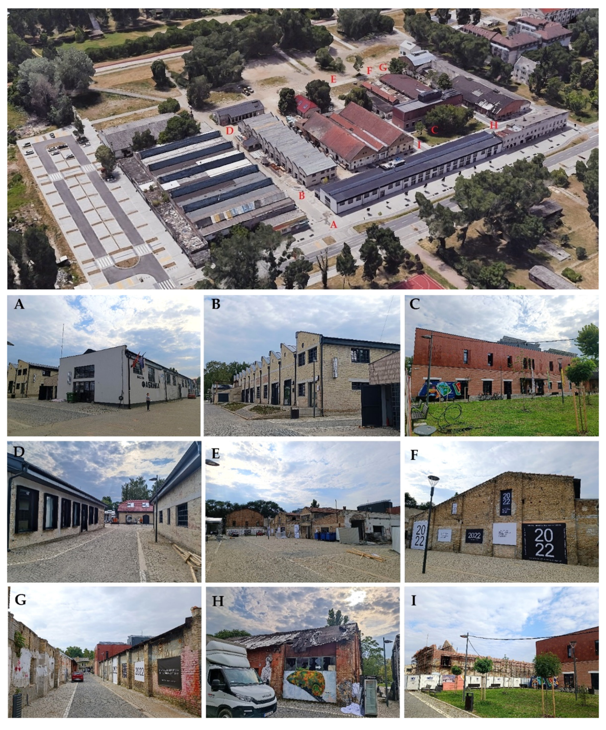
Figure 5. Third phase of the redevelopment stage: early 2022 (aerial view) and September 2022 (site photos).

ation with Civil Society of the City of Novi Sad; No. 5 (B): partially activated, with four art studios; No. 7 (C): fully activated by the Liman Cultural Station and the EYC offices. Buildings No. 11, 12 and 13 (D) are fully refurbished, yet vacant, with still undefined future users. Building No. 6 (I) is currently under construction, as the reconstruction was not possible due to the poor technical conditions. The renewal of the rest of the building stock (E–H) has not yet started although the designs are finished, while the construction of three new buildings facing the Danube (private investments) is pending.