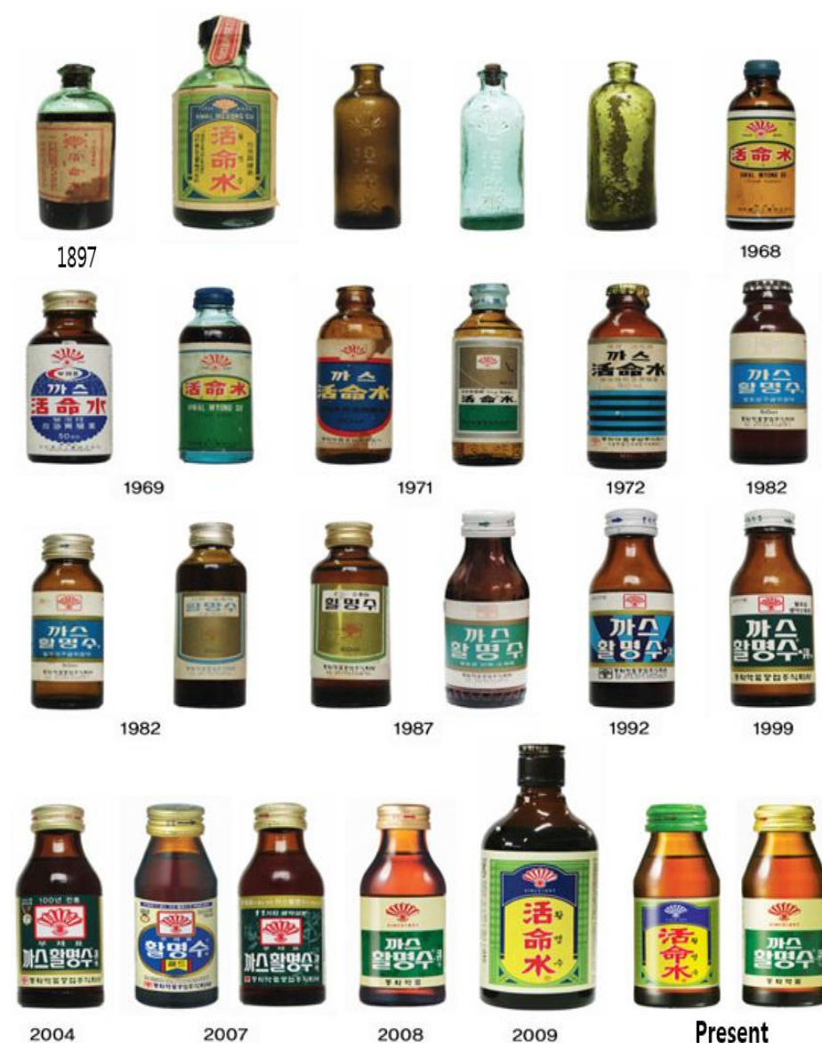
Figure 1. The innovation of Dongwha Pharmaceutical’s signature medicine, “Lifesaving Water”, since 1897.

Korean War (1950–1953), and Korean industrialization led by Korean conglomerates (called “chaebol”) (since the 1960s). Even having experienced such a tumultuous history, based on the company’s philosophy, Dongwha was the center of liaison offices to support the Korean Independence Movement and financially supported the national enlightenment movement during the Japanese colonial period. In addition, when they faced cutthroat competition from other imported foreign medicines and new domestic medicines, the company overcame the challenges through win-win strategies with their traditional partners (wholesale pharmaceutical distributors) [15]. Even based on valuable traditions, under many challenges and environmental changes, long-term survival of Donghwa was not possible without continuous efforts toward changes while protecting core competencies. Thus, the right balance between tradition and innovation is a key success factor [13].