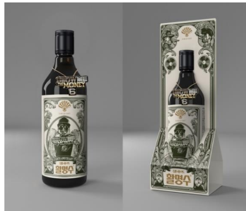
Figure 3. Special editions of Dongwha Pharmaceutical's signature medicine, "Lifesaving Water".

Finally, based on the philosophy of Whal Myung Su, meaning "lifesaving water", Dongwha Pharmaceutical contributes to society through its "Lifesaving Water Campaign", which provides clean water to people in African countries without a sufficient supply of safe drinking water. In celebration of World Water Day, the campaign was held in partnership with the United Nations Children's Fund (UNICEF), as shown in Figure 4. As a corporate social responsibility (CSR) activity, a certain proportion of the sales of Whal Myung Su was used to send clean water to children who suffered from a shortage of drinking water, to purify drinking water, and to build clean wells in Africa [15].