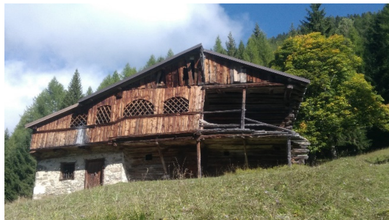
Figure 4. Mas di Sabe with the forest behind—10 October 2019.