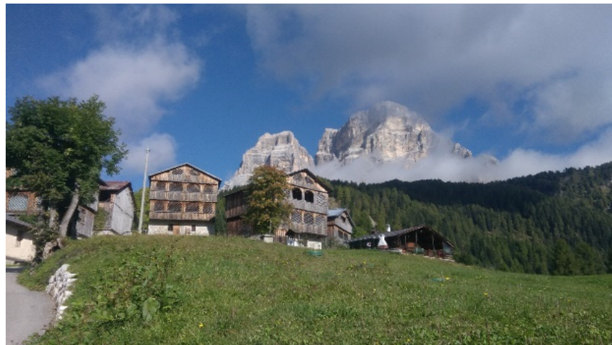
Figure 3. The other high-rise tabià of the area—10 October 2019.

Among the ancient tabià, the Mas di Sabe (Figure 4) was founded around the XVI century in an area close to Val di Zoldo called Costa. Over the years, the farmers and iron handcrafters' families inherited the Mas di Sabe, using it in a variety of ways. For instance, it was employed as a barn for keeping livestock and hay or as a gathering place for local inhabitants' meetings. Originally the structure was composed of the farmer's house, a barn, smaller agricultural buildings, and agricultural and forest lands. Moreover, the tabià was big enough to host more than one family simultaneously. Unfortunately, during the XIX century, the owners' house was destroyed, leaving the barn the only survivor of the ancient complex of buildings.