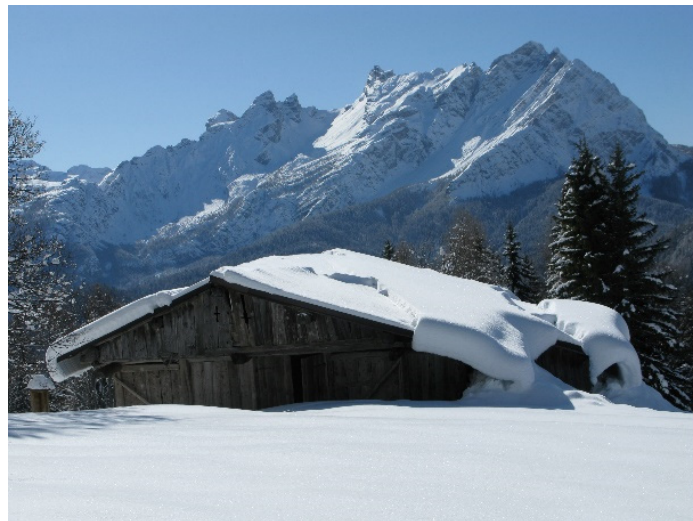
Figure 7. Mas di Sabe's structure is challenged by annual snow—winter in the Nineties.