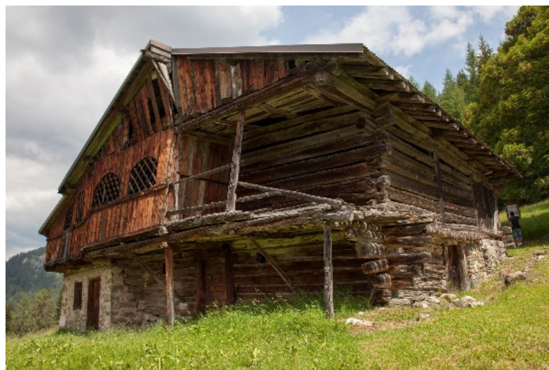
Figure 5. The blockbau structure—spring in the Nineties.

Besides its architectural characteristics, the tabià also benefits from its position under the Pelmo and Civetta mountains, which belong to the Dolomiti UNESCO (Figure 6). The mountains, the field, the adjacent forest, and the several legends on the building create a relaxing environment that attracts local and external visitors who want to enjoy this intimate and fascinating setting. The Mas di Sabe also represents a crossroads of several local paths, such as the mulattiera that connects the building with the village of Iral, creating a ‘network’ with the other tabià scattered across the area. For this reason, the building has become one of the stops of a local route which can be explored by families and mountain lovers in Zoldo’s valley.