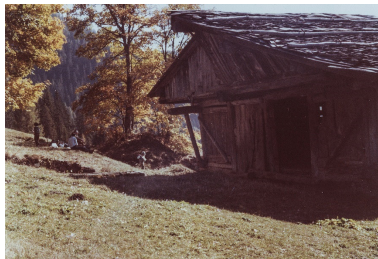
Figure 9. People gathered at Mas di Sabe's field—summer in the Nineties.

It's a special place. I mean, when you're there, your heart opens up. (FMPM)