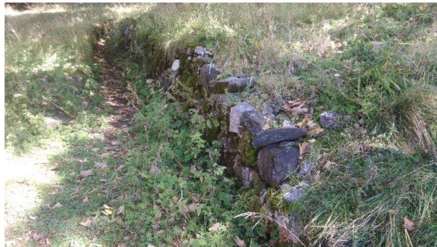
Figure 2. Mulattiera stones—10 October 2019 (Eurac).