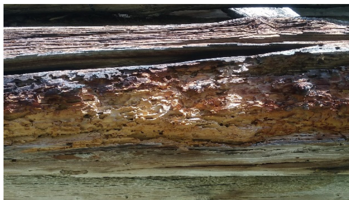
Figure 8. Mas di Sabe's damaged board—10 October 2019.

Because it represented the local agricultural and handcrafted tradition for centuries, the Mas di Sabe has become an identity symbol for the local population who do not hesitate to express feelings of attachment and belonging. For this reason, the Mas di Sabe, together