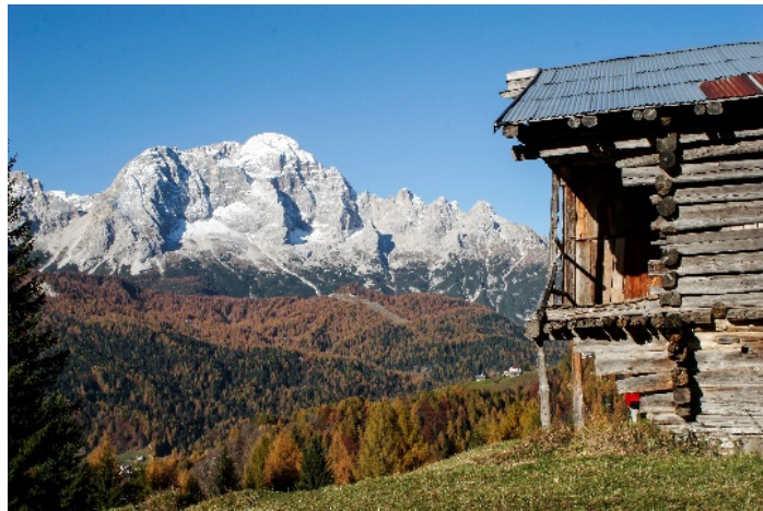
Figure 6. The surrounding landscape of Dolomiti UNESCO—fall in the Nineties.