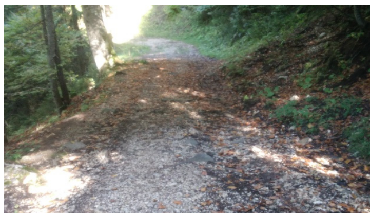
Figure 1. The mulattiera connects the Mas di Sabe with the village of Iral—10 October 2019.

This paper investigates Val di Zoldo, a mountain municipality in the province of Belluno (Veneto) at 1.177 m above sea level and with 2.862 inhabitants (2021), the adjacent districts of Costa—where the Mas di Sabe is located—and the district of Iral—which is connected to the building by a 'mulattiera', an ancient path also included in the renovation project (Figures 1 and 2). The entire territory is dominated by the Dolomiti UNESCO (World Heritage Site since 2009), an attraction for Italian and foreign mountain lovers and known for its ski facilities, trekking, and biking routes, which explains why the local economy of the entire territory is based mainly on tourism.