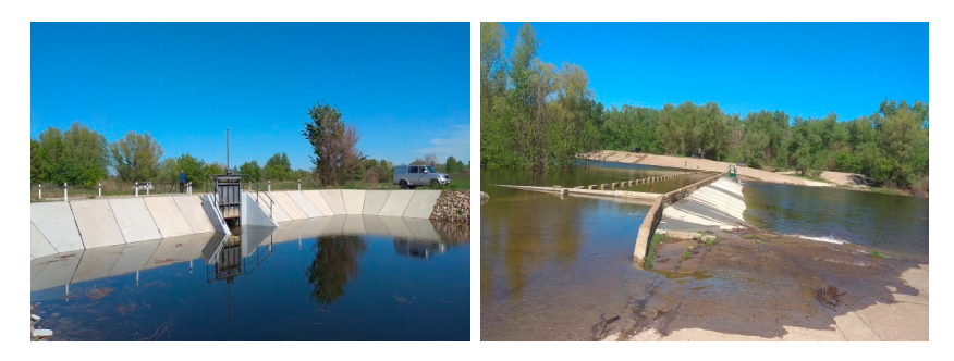
Figure 4. Restored condition of the Akhtuba River and the Volga–Akhtuba floodplain.

With the help of the implementation of the federal project for additional artificial flooding of the Volga–Akhtuba floodplain, it is planned to solve these problems and restore ecological stability and natural balance in the regions of the Lower Volga region. The complex of hydraulic structures under construction will allow creating an artificial hydrological regime on the Akhtuba River and will allow filling the floodplain even in a low-water period (Figure 4).