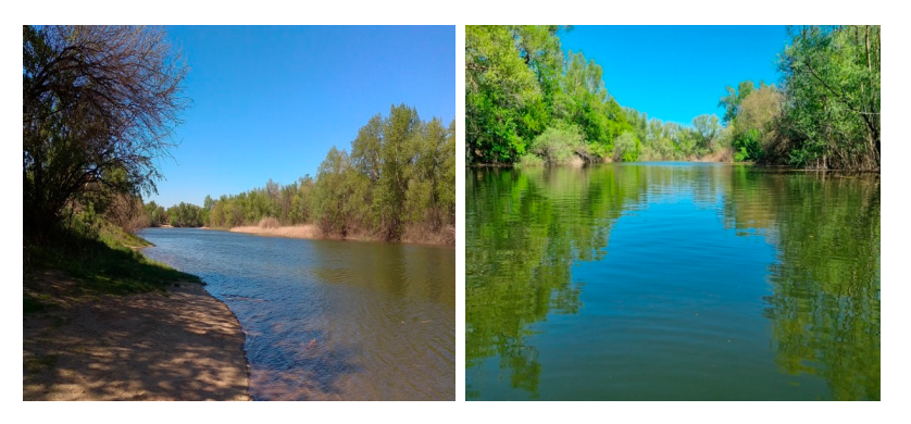
Figure 2. The initial state of the Akhtuba River and the Volga–Akhtuba floodplain.