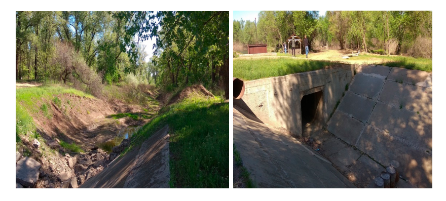
Figure 3. The deteriorated state of the Akhtuba River and the Volga–Akhtuba floodplain.

With the help of the implementation of the federal project for additional artificial flooding of the Volga–Akhtuba floodplain, it is planned to solve these problems and restore ecological stability and natural balance in the regions of the Lower Volga region. The complex of hydraulic structures under construction will allow creating an artificial hydrological regime on the Akhtuba River and will allow filling the floodplain even in a low-water period (Figure 4).