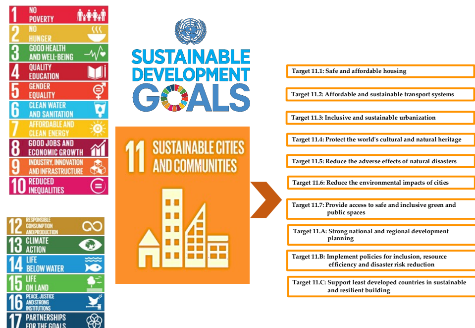
Figure 2. Sustainable Development Goal 11 (adapted and modified from [4]).

However, SDG 11 recognises that cities, particularly those in developing countries and the Global South, where poverty, environmental degradation, and the dangers posed by climate change and natural catastrophes are primarily an issue of urban life rather than rural life. Sustainable, inclusive, and equitable cities require stakeholders to produce realistic localised indicators and outputs suited to each city's particular urban circumstances [19]. As the community grows more appreciative of the fully integrated mixed development concept of sustainable cities, which provides an innovative and sustainable design milieu for sustainable communities, this concept becomes more prevalent globally [20]. Indeed, it has demonstrated that urban planning and real estate development have moved in tandem with ever-changing sustainable development patterns and are gradually responsive to the community's needs and requirements towards SDG 11. As the mixed development project is categorised as a multifaceted project identical to the concepts of a sustainable project, green building project, and megaproject, the interconnection between stakeholders also contributes to the project's complexity [21].