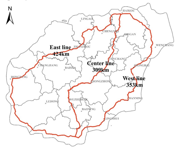
Figure 1. Diagram of the Hainan cycling routes.

For this article, we chose Hainan Island in southeastern China as a case study. Hainan Island is known as the "Hawaii of the East" and is one of the world's most important tropical destinations, with rich tourism resources, well-organized cycling, and excellent infrastructure [50]. As of 2020, including the third top international cycling event in Asia, the "Tour de Island", China's Hainan Island has held fourteen international road cycling races, and its high profile as a result of the "Tour" race has continued to attract cycling enthusiasts from both China and abroad, creating a strong cycling tourism atmosphere. With its newly created, island-wide "Sports Tourism Demonstration Zone", the Hainan Provincial Government has also now incorporated the island-wide cycling tourism industry into its new round of overall tourism planning [50]. Hainan cycling routes are primarily divided into the East, West, and Central routes (see Figure 1), each with its own characteristics and charm. The East route has the most densely populated towns and has a deep cultural heritage; the West route is relatively challenging, slightly less convenient, and has relatively small towns; and the Central route is more difficult to ride and requires climbing up hilly and even mountainous terrain.