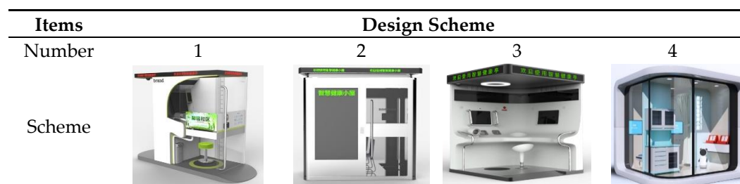
Table 1. Four types of design schemes of SHK.