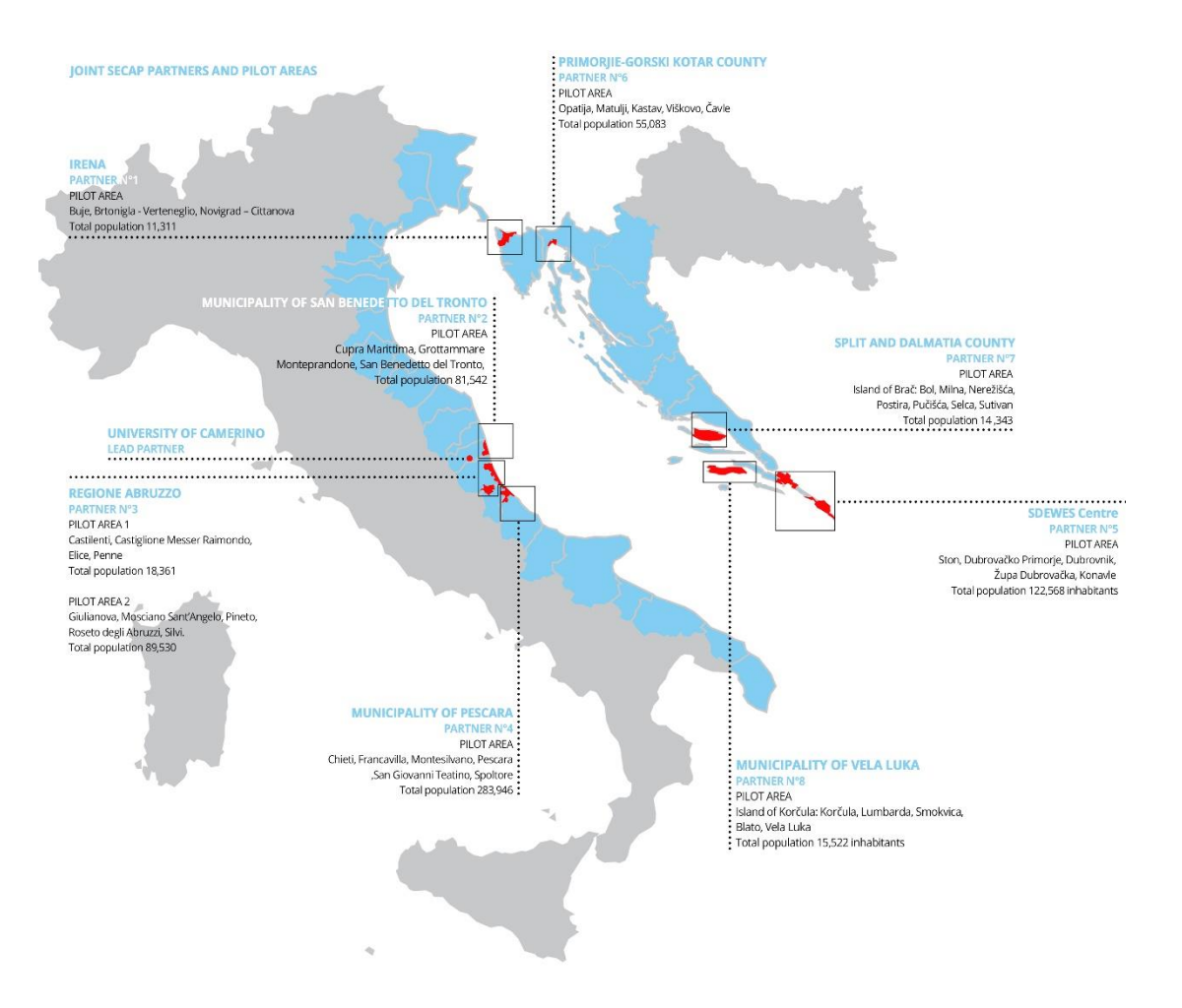
Figure 1. Pilot areas of the Joint_SECAP project.

The main objective of the project was to improve climate change monitoring and the planning of adaptation measures to tackle specific effects in the area of cooperation. Another goal of the project was to increase the knowledge of local authorities and their capacity regarding climate adaptation in coastal areas, enabling them to adopt a supramunicipal approach to improve the performance of these measures in pursuit of European policies and targets.