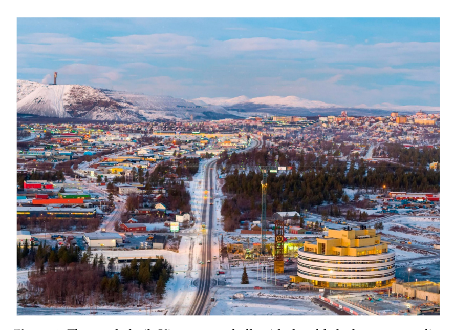
Figure 4. The newly built Kiruna town hall, with the old clock tower standing next to it. The old Kiruna and its mining landscape are in the background.

The newly designed city centre appears to be far from the old one: scattered buildings and shops in the old city centre have now been replaced by a speculative square, with the new City Hall in its corner where commercial streets, as supposedly social spaces, are conjoined to this centre. The design of the new city centre clearly addresses the limitation of 'relocation,' as it means rebuilding a 'new' city 'spatially and socially' for 'old' citizens, with a few cultural and historical elements of the old Kiruna. The new City Hall, illustrated in Figure 4, is the first building in the new city, as a respectful and sensitive gesture to Kiruna's old city hall, a symbolic building that during 55 years became known as "Kiruna's living room," and had to be demolished. The clock tower was moved, for symbolic reasons, to the new City Hall building.