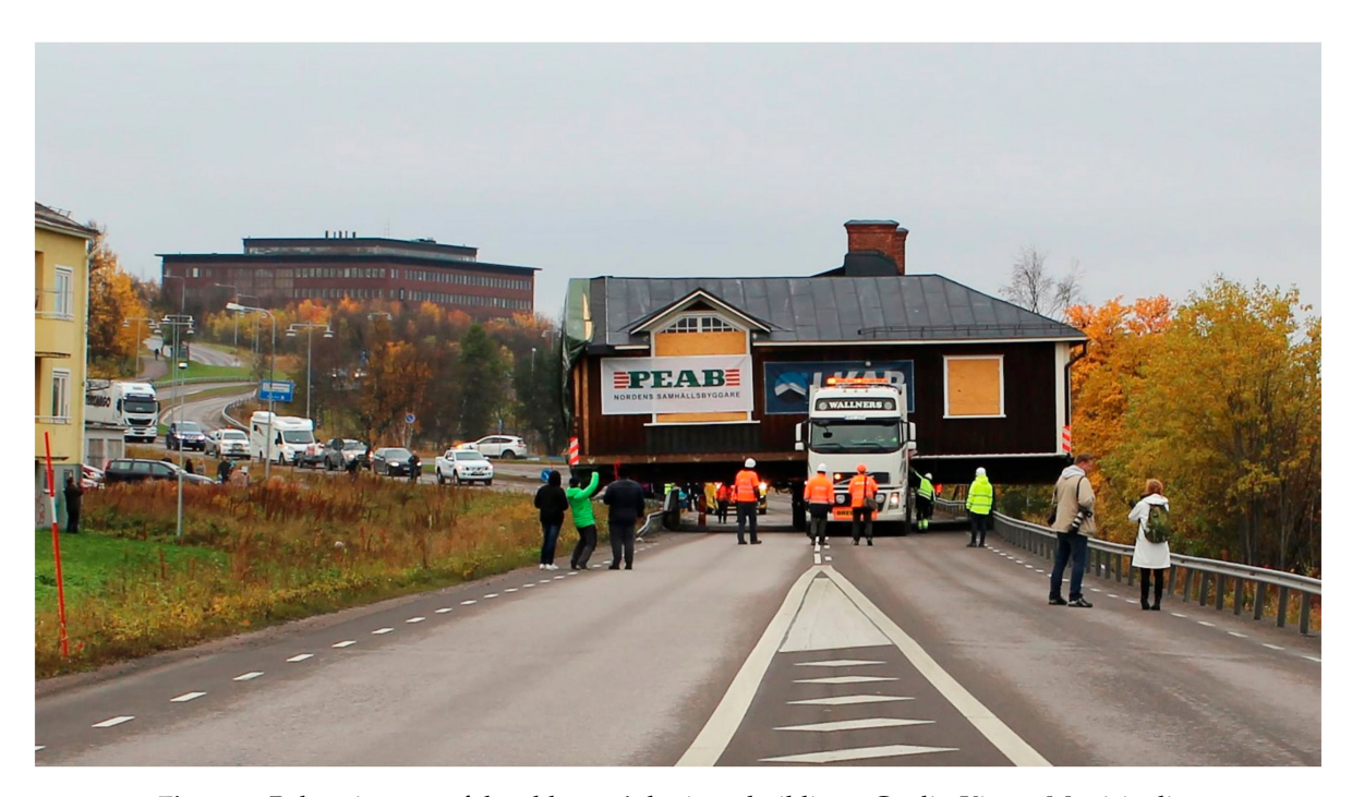
Figure 3. Relocating one of the old town's heritage buildings.

during the relocation. The municipality, LKAB and White Architects placed emphasis on moving buildings that were considered to be Kiruna's architectural signature and cultural heritage. The plan included moving some of the cultural identity and cultural landmarks to the new city centre, and mixing some of the old buildings or incorporating parts of them into the new structures (such as the relocation of the clock tower of the old city hall next to the new city hall). Moving these buildings, as illustrated in Figure 3, occupied significant space in the media in terms of the technology used during this process. However, the result shows they were only partial actions and responses [21] that considered the technical and financial limitations of moving all listed buildings. The shift in the decisions made between LKAB and the municipality shows the lack of relation between the personal and practical spheres of transformation.