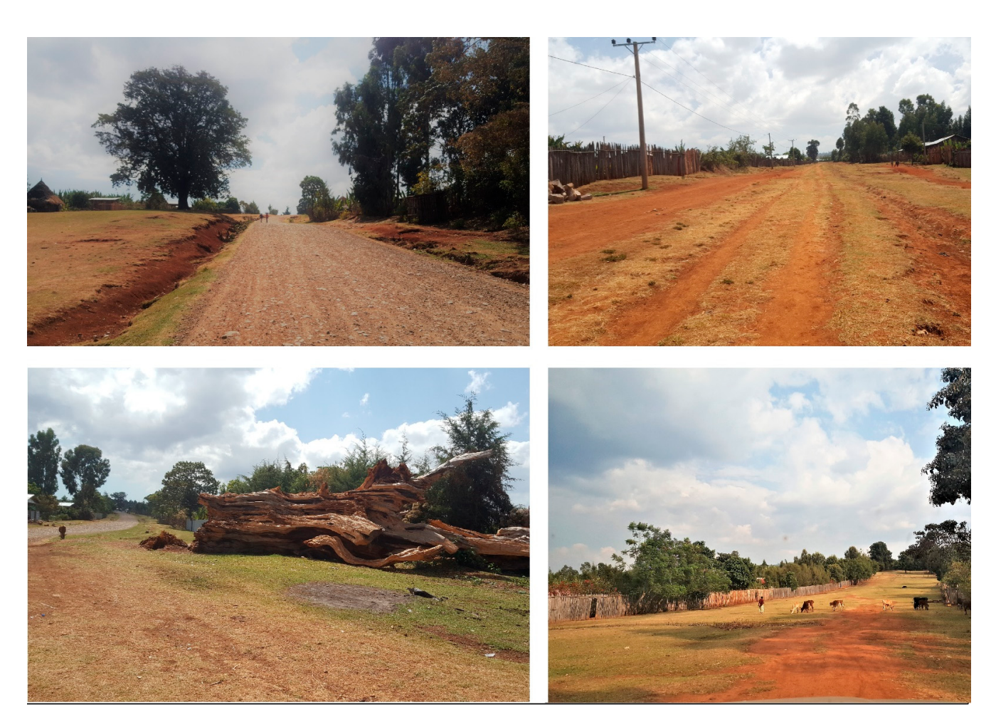
Figure 4. Perceived changes in the landscape mainly by road constructions.

The trend for the past 50 years in the case study shows that the NCP use at different localities has been decreasing (see Table S5). Traditional religious practices have faded in all localities. In villages where conventional roads have been constructed, the contributions, such as local temperature, climate, and water-flow regulation, have been decreasing because of the removal of an important ecology. In such localities, interactions with villages on the opposite side decrease, children cannot play without risks, and the aesthetic quality and scenic beauty of the cultural landscape reduce. There is no change in access to Jefoure roads for humans and livestock or holding Christianity-oriented practices in all localities. The use of Jefoure roads for vehicle transportation has increased in all localities. For a long time, Jefoure roads have served as places to enhance mental and physical health and continue as recreational and ecotourism destinations. Currently, even though only some children and youths play traditional games, such as Zore, Yegenna Chewata, and horse competition, the Jefoure roads still play a significant role in mental and physical health, recreation, and ecotourism.