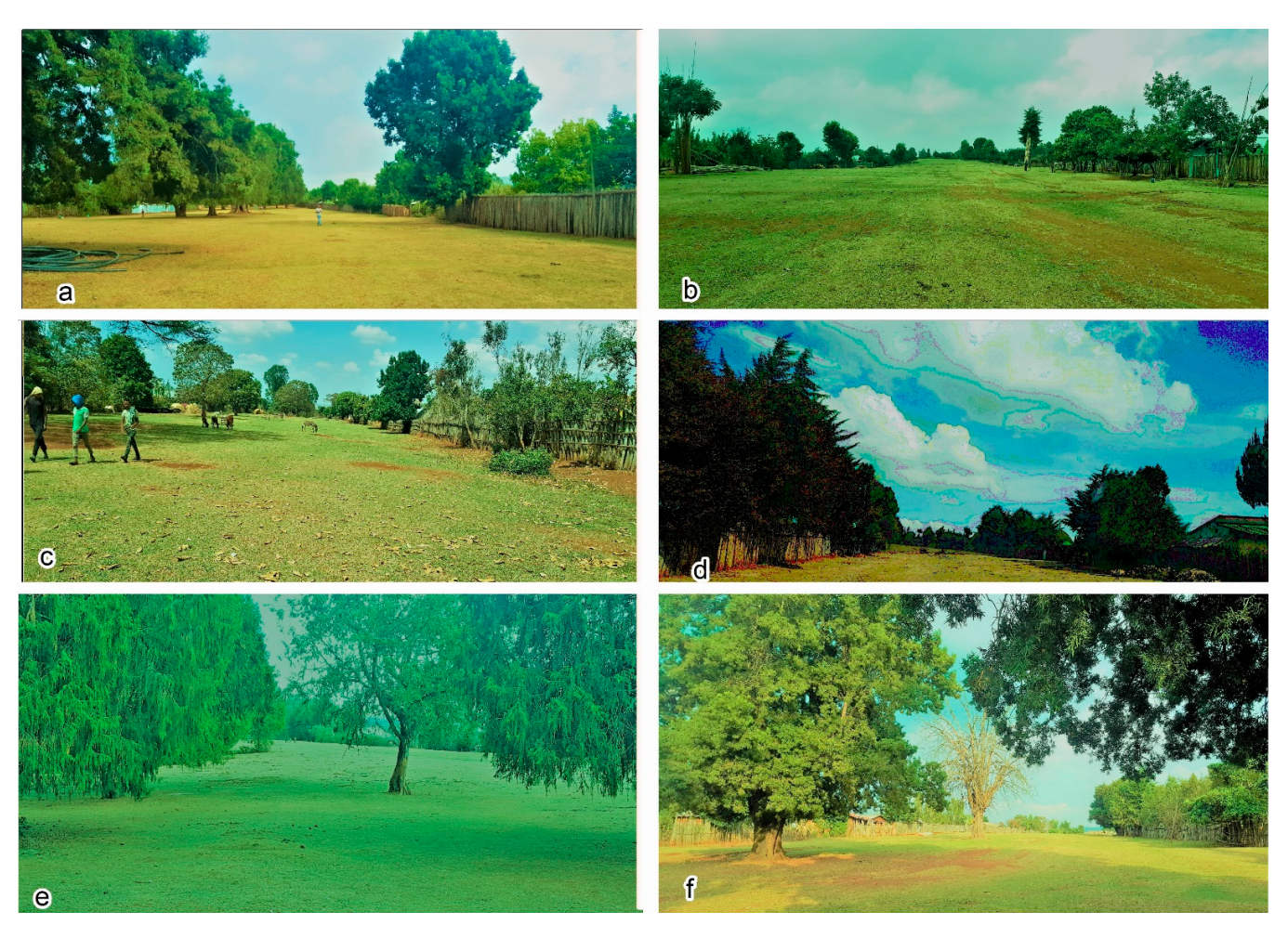
Figure 3. An overview of the selected Jefoure roads sites: (a) Inagera, (b) Selam, (c) Cheret, (d) Aegera, (e) Yadazer Yezhira, (f) Gehared (field survey, February 2020).