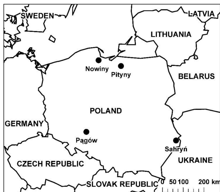
Figure 1. Locations of field experiments.

In the 2016–2017 and 2018–2019 seasons, field trials consisting of 10 individual experiments with winter rapeseed were performed: 3 in 2016–2017 (Sahryń, 50°41' N 23°47' E, Pagów, 51°09' N 17°39' E and Nowiny, 54°16' N 18°27' E); 2 in 2017–2018 (Sahryń and Pagów); and 5 in 2018–2019 (Sahryń and Pagów (2), and Nowiny and Pityny, 54°01' N 20°06' E) (Figure 1). The soil of the experimental fields consisted of Calcic Chernozem (silty clay loam: 34% clay, 14% sand, 52% silt) in Sahryń; Albic Podzols (soil texture class sandy loam with soil fraction content of 10% clay, 55% sand, 35% silt) in Pagów; Endocalcaric Cambisol (soil texture class sandy loam with soil fraction content of 11% clay, 70% sand, 19% silt) in Nowiny; and Endocalcaric Cambisol (soil texture class sandy loam with soil fraction content of 12% clay, 64% sand, 24% silt) in Pityny [41].