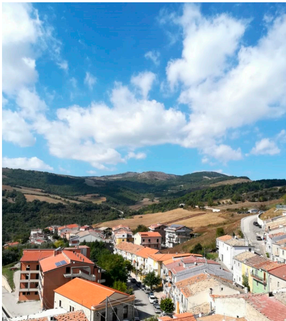
Figure 2. Castelluccio Valmaggiore: view from the belvedere (ph. F. Rinella, 30 September 2018).

a significant moment of conviviality, a time for socializing and sharing among residents and travellers, a re-enactment of ancient meals in friendship and happiness, an example of authentic relationships and genuine dishes (sausages, bean soup, "Spezzatielle", that is local lamb with chicory, eggs and pecorino cheese, and local wine).