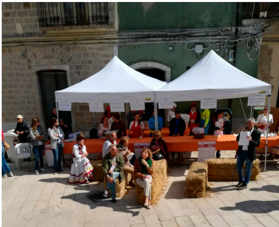
Figure 3. Castelluccio Valmaggiore: the lunch set in front of the Main Church (ph. F. Rinella, 30 September 2018).

and S. A. Cohen define as “hot authentication” [53] (p. 1303) deeply rooted in the “daily life flow” (ibidem, p. 1300) and, therefore, focused on “flavours” and “smells”, territorial basis of the identity of a “small” community, but suitable to the need and wishes of many “temporary citizens” in search of new “destinations to experience” [40].