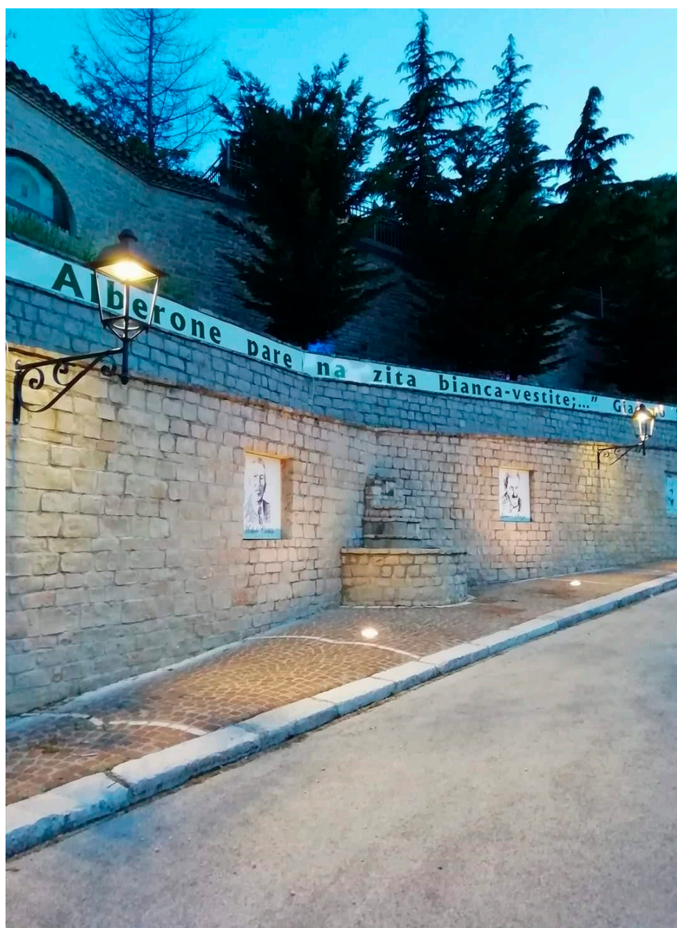
Figure 4. Alberona: the “Muro della Poesia”.

to be mentioned: (1) the project for an underground museum network, to be managed by a community cooperative composed of Alberona young people, for which an allocation of EUR 1,000,000 was applied for to the MiBACT; (2) the project for the construction of a panoramic cableway to connect the village to the top of the Monte Crocione-Pagliarone, for which an allocation of EUR 14 million has been applied for to the central Government, to be complemented by nature trails and rest areas, a bicycle parking station and the recovery of sheep tracks [59,60].