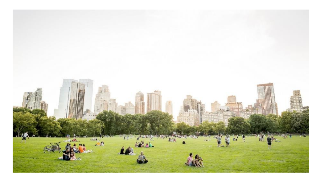
Figure 6. Central Park in New York City is a highly popular inner-city urban park that helps to keep Manhattan over 3 degrees Celsius cooler during extreme summer months.

Often described as the lungs of New York City, Central Park's size and cultural position have made it a model for the world's urban parks. Between 2015 and 2018, the park's drives were closed to vehicular traffic. The real estate value of the surrounding land had started rising significantly already in the mid-1860s during the park's construction, and—though most of the city's rich formerly lived in mansions—many of the wealthy citizens of New York City moved into apartments close to Central Park during the late 19th and early 20th centuries. It is estimated that Central Park has resulted in billions of dollars in economic impact and increased the value of surrounding real estate. About 600,000 people live within a ten-minute walk (a maximum of about 800 m distance) of the park's boundaries (see Figure 6).