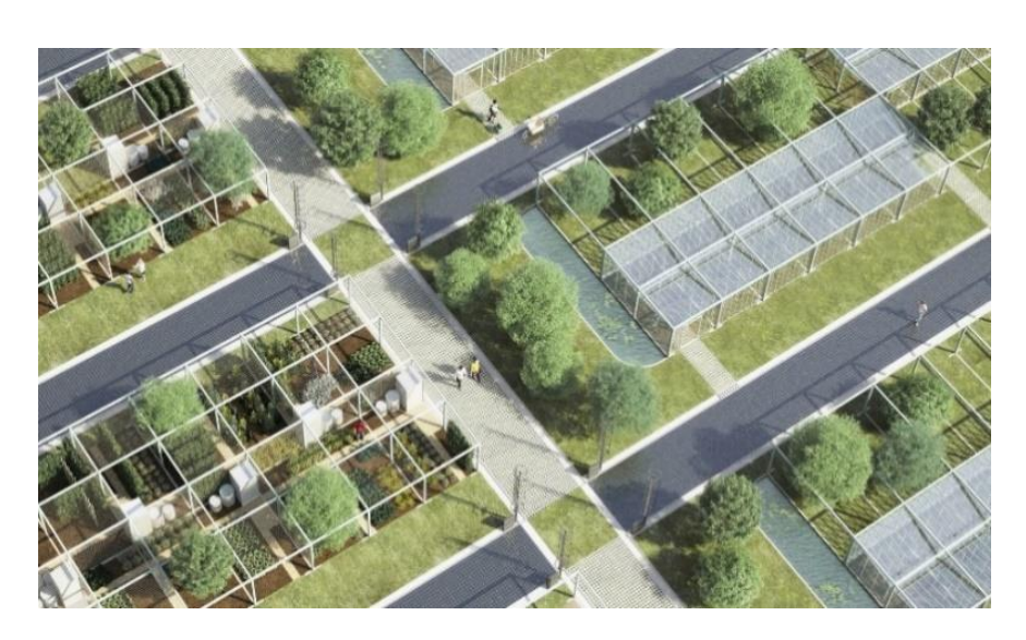
Figure 4. The conceptual proposal Car Parks 2.0 transforms large carpark lots into a productive field for urban farming; by French design firm Studio NAB, 2019.

Greenhouses and fruit trees grow produce that can be supplied directly to the neighboring store—like the model used by the urban farming company Gotham Greens, which grows produce in a greenhouse on top of a Whole Foods rooftop in New York. Some parking spaces remain, where the asphalt is replaced by green space that can help sequester CO_2 and absorb rainwater. Urban communities have not typically been associated with food production, which is associated mainly with rural spaces. Through significant technological advances (e.g., robotic farming using hydroponics), urban agriculture could possibly meet up to 10% of the entire food demand of urban communities and make meaningful contributions to food security, public health, and urban sustainability and resilience.