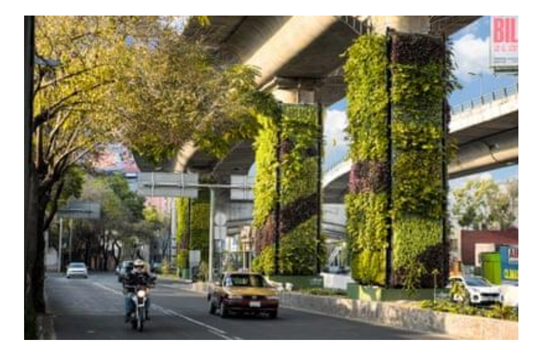
Figure 9. Mexico City has planted "green pilotis" underneath their freeways to create a kind of green wall that reduces the fine dust and pollutants for residents along the inner-city freeways. These vertical gardens on columns along the Periférico highway, which rings the central city, were the only possibility since there is no space to plant trees.

Researchers at Wageningen University found that a 150-year-old beech tree bears around 800,000 leaves, which the tree uses to evaporate up to 500 L of water every day. During the same period, it absorbs up to 24 kg of CO<sub>2</sub> (as much as a small car emits while travelling 150 km) and produces around 11,000 liters of oxygen—the daily breathing requirement of 26 people. In Mexico City, most of the local pollution is attributed to the excessive use of private cars. Mexico City has planted "green columns" alongside highways and underneath flyovers and turned pillars into green walls that reduce the fine dust and pollutants for residents along the inner-city freeways. Since 2016, more than 1000 concrete columns have been turned into vertical walls, which capture fine pollutant particles and reduce pollutant concentration in Mexico City's street canyons (see Figure 9).