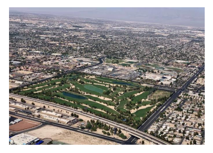
Figure 3. Aerial photo of rapidly urbanizing Las Vegas, today a city with 2.3 million people (2020). The city is the fastest warming city and one of the fastest growing cities in North America. The expansion of car-dependent suburbs into the desert is possible due to the lack of an effective urban growth boundary. The photo shows one of 53 inner-city golf courses, which pose a significant irrigation burden to the desert city (source: photo by the author, 2020).