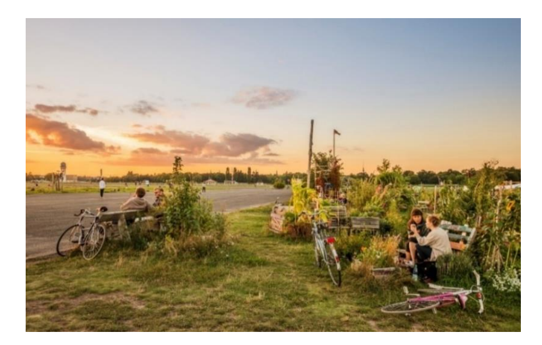
Figure 8. The Tempelhofer Feld (Tempelhof Field) is a new public recreational area on the former inner-city airport in Berlin. The airport closed in 2008 and its enormous 386-hectare open space, the former airfield, was turned into a public park (opening in 2010), offering cycling, skating and jogging trails, urban gardening sections and a large rewilding area.

Restoring urban areas and regenerating ecosystems by using natural systems has been recognized as an effective solution for many years. Adding green roofs and plants to the tops and sides of buildings provides significant ways to improve the urban microclimate, and wet roofs that temporarily store water can help to cool buildings naturally through evaporative cooling. There are now plans for urban landscape restoration and rewilding projects worldwide, with the aim to create leafy, resilient, and healthy places in cities. Berlin's former inner-city airport Tempelhof has been turned into a natural oasis and popular public recreation area: Tempelhof Field has been successfully renatured, also offering an efficient carbon sink (see Figure 8).