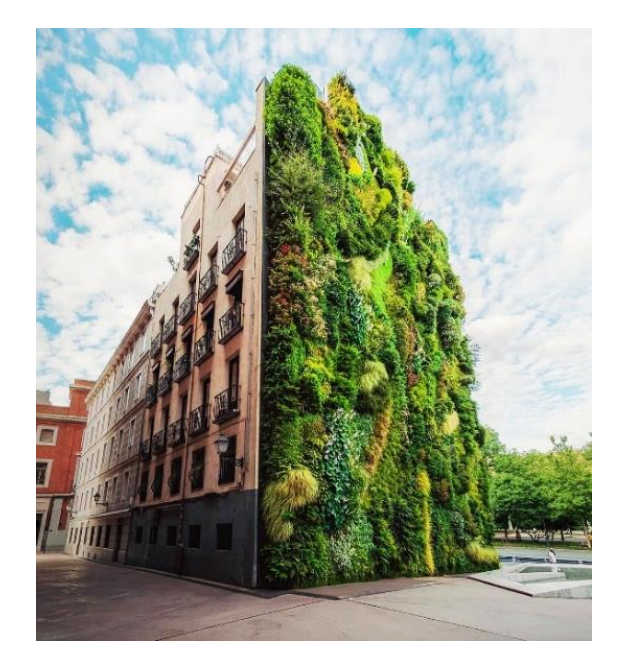
Figure 2. Growing biodiverse urban futures: vertical garden (living wall) in Madrid, covering an entire exterior wall of the building with plants. Living walls have become popular over the last ten years; however, some have problems with irrigation or selection of plant species and have become a maintenance burden.

Figure 1. An urban forest in Melbourne, Australia, helps to keep the city cooler during heatwaves and binds dust from traffic. The City of Melbourne has formally embraced an Urban Forest Strategy with the aim to increase tree canopy cover from 22 percent to 40 percent by 2040 (the Strategy 2012–2032 is available online, https://www.melbourne.vic.gov.au/community/greening-the-city/urban-forest/Pages/urban-forest-strategy.aspx, accessed on 25 November 2020).