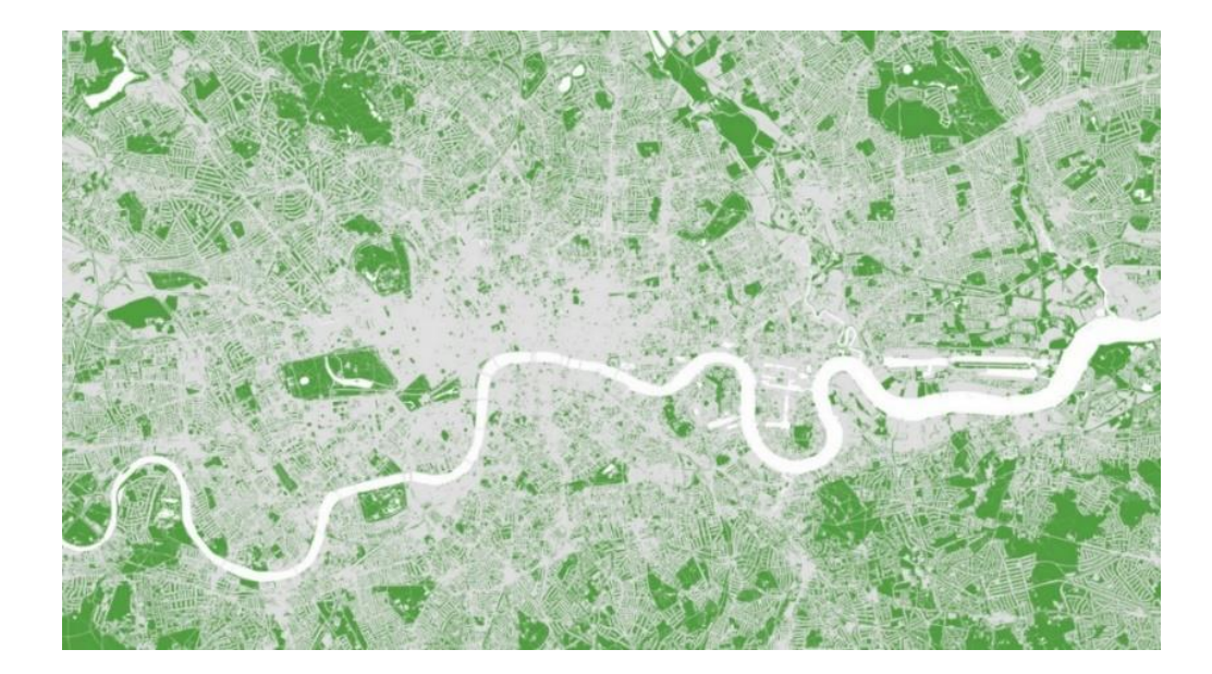
Figure 7. A map of London showing the green spaces. Every green space in the city, big or small, contributes to health and wellbeing (Source: Greater London Authority, 2020).

As climate change brings higher temperatures and unpredictable downpours, cities are expecting a new kind of resilience from their urban green spaces and trees. There are numerous tree-planting programs on the way. In the European Union, three billion new trees will be planted across the 27 member states by 2030, many in and around cities. Some European politicians have become influential advocates for prioritizing nature restoration as part of the EU Biodiversity Strategy for 2030: Bringing Back Nature [59]. Ambitious greening projects are also on the way in several megacities, including New York City, which planted a million trees between 2007 and 2015. London hopes to green more than half the city by 2050 to make the world's first "national park city", while Paris recently announced that it is creating four inner-city urban forests in 2020 (see Figure 7).