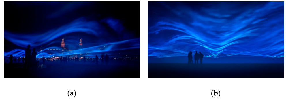
Figure 3. (a) Daan Roosegaarde, Waterlicht, Amsterdam. 2015. (b) Daan Roosegaarde, Waterlicht, Schokland. 2015. (Daan Roosegaarde, Waterlicht, 2015, Source: <a href="https://www.studioroosegaarde.net/project/waterlicht">https://www.studioroosegaarde.net/project/waterlicht</a> (accessed on 27 December 2020), image by Pim Hendriksen).

Daan Roosegaarde deals with the interrelationship between scientific technology, art, space, and people. Roosegaarde produces Waterlicht using blue LEDs and lenses to create a virtual flood, influenced by rain and wind, while contemplating the future (see Figure 3). He engages with designers and engineers to merge technology and art. This work has been exhibited in various cities, such as Amsterdam, London, Paris, and New York, since 2015. Waterlicht raises awareness about rising water levels due to global warming. This work expresses the enormous power and poetry of water. It simulates "what it would look like if the Netherlands's dikes did not exist, and the complete country was flooded in order to raise awareness about the power of water" [39]. Waterlicht allows viewers to have a sensory experience of a virtual flood. It triggers them to pay attention to the human impact on the environment, which causes sea level rise. It transforms squares into an airy dream-like landscape.