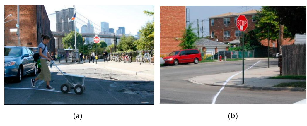
Figure 5. (a) Eve Mosher, High Water Line, New York. 2007. (b) Eve Mosher, High Water Line, Santa Cruz. 2018. (Eve Mosher, High Water Line, 2007).

Like Daan Roosegaarde, Eve Mosher also deals with sea level rises due to global warming. However, Eve Mosher's High Water Line presents a social form of art-activism, which is at the intersection of arts, culture, and environmental sustainability (see Figure 5). Mosher uses "a sports field chalk marker to draw a blue 'high water' line around Manhattan and Brooklyn" [44], showing the anticipated high water line of the city in a local context.