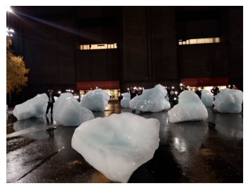
Figure 2. Olafur Eliasson, Ice Watch, London, 2018. (Olafur Eliasson, Ice Watch, 2018).

A number of people visit the area to watch Ice Watch, touching them and sharing images of people hugging or kissing on social media. This installation makes an invisible future image, in which ice will have disappeared, visible. Eliasson brings the melting ice to people, and "the impact of the installation [ ... ] will allow people to see the effects of climate change, which are otherwise invisible or unknowable" [37] (p. 65). Ice Watch stimulates the viewers' awareness of their environment and their position as phenomenological subjects within it.