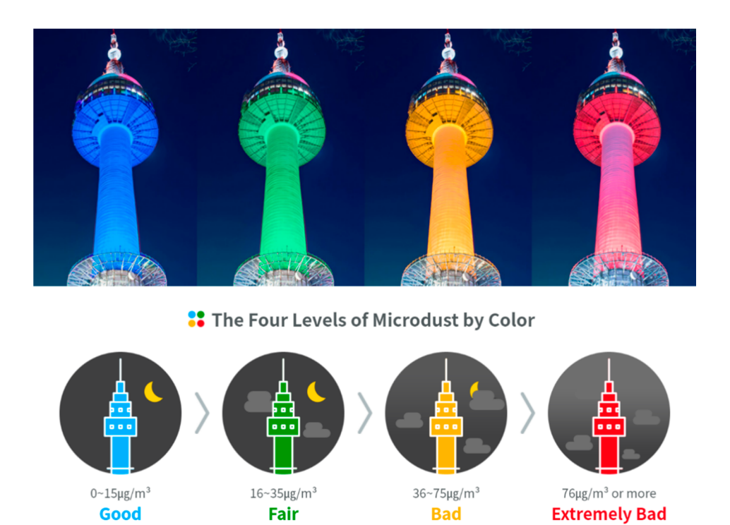
Figure 4. Seoul City Council, The Secret of Namsan Seoul Tower Illuminations: Four Levels of Micro Dust by Color, 2011–present. (Seoul City Council, 2011–present, Source: https://www.seoultower.co.kr/en//tour/tower_light (accessed on 27 December 2020)).

The Namsan Seoul Tower project uses scientific data that is converted into visual images and presents it through colored lights in order to inform people about the current level of pollution caused by micro dust in real time (see Figure 4). This work directly by stimulating the behavior of Seoul residents, as it lets them know whether or not they have to wear masks. In the last few years, micro dust has been increasing and is now seen as a significant issue that affects Korean everyday life. According to the Ministry of Environment in Korea, micro dust (or fine dust) is a phenomenon that occurs in Korea and neighboring countries due to climate change. As the polar glaciers melt due to global warming, the temperature difference between the polar regions and the Eurasian continent decreases. As a result, the north-west monsoon weakens, causing atmospheric congestion on the Korean Peninsula. When the north-west monsoon blows strongly, micro dust will fly to the East Sea, but if greenhouse gas emissions remain the same as they are now, the occurrence of high concentrations of micro dust will inevitably increase in Korea [40]. According to the BBC News, Koreans are growing increasingly concerned about the effects that the micro dust has on their health. as air pollution was causing them physical or psychological pain [41].