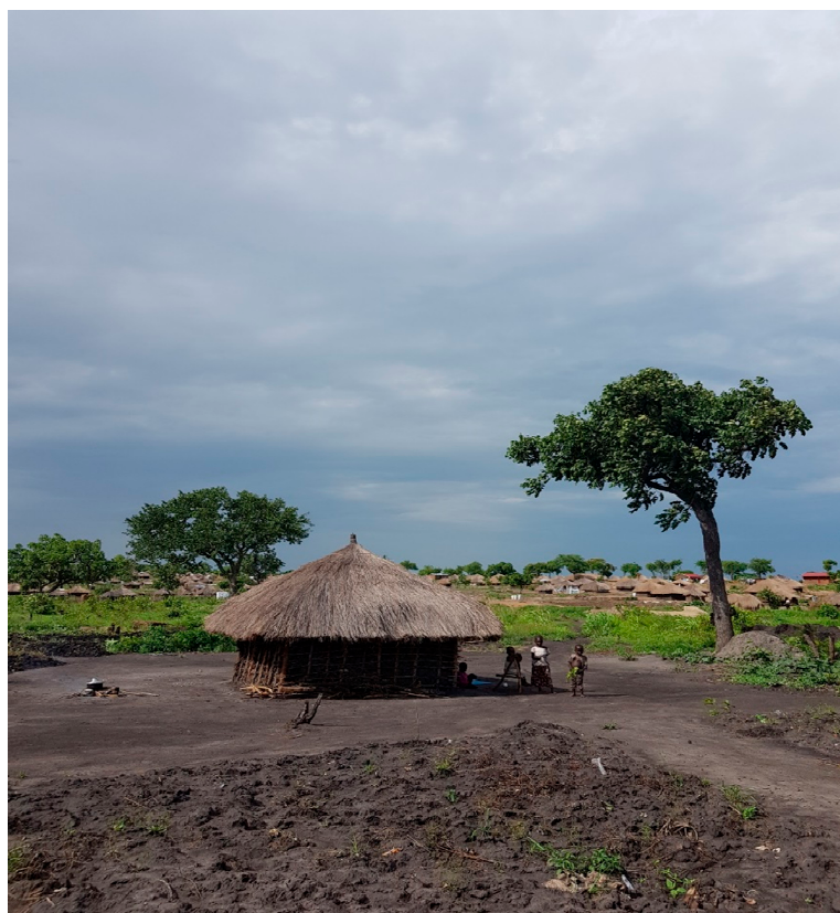
Figure 2. Rhino Camp, Refugee household.

in the Rift Valley to 788 m. Rhino Camp has 123,243 registered refugees and covers an area of 85 km 2 . The Rhino Camp project area lies inside the shallow Albertine rift. The Anyau River to the north and the Arua-Rhino Camp main road to the south form the borders of the settlement. Rhino Camp has six zones: Eden, Siripi, Ofua, Tika, Ocea, Tika and Odobu. The settlements are governed by the Office of the Prime Minister (OPM) for refugee operations and monitored by UNHCR. OPM oversees issues regarding land, including allocations, legal matters, and enforces laws. The role of UNHCR is to monitor and support programmes implemented in the settlements. There are several agencies, local and international, that work within the settlements in various sectors, including Water, Sanitation and Hygiene (WASH), Safe Access to Fuel and Energy (SAFE), Livelihoods, Environment and Education.