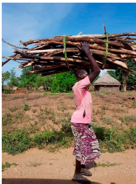
Figure 5. Woman carrying firewood for selling or cooking in refugee settlement in northern Uganda.