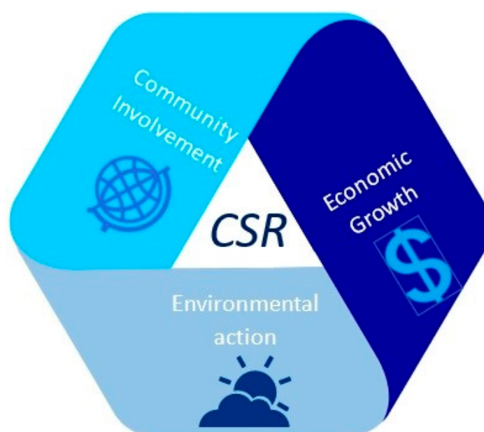
Figure 1. Activities of Corporate Social Responsibility.

Sustainable development is obtained through the management of environmental, natural, economic, social, cultural and political factors. These issues are interrelated and therefore should not be considered independently. They are part of the concept of CSR and have a voluntary character. They can be grouped into economic, social and environmental areas (the “triple bottom line”) [8] (see Figure 1).