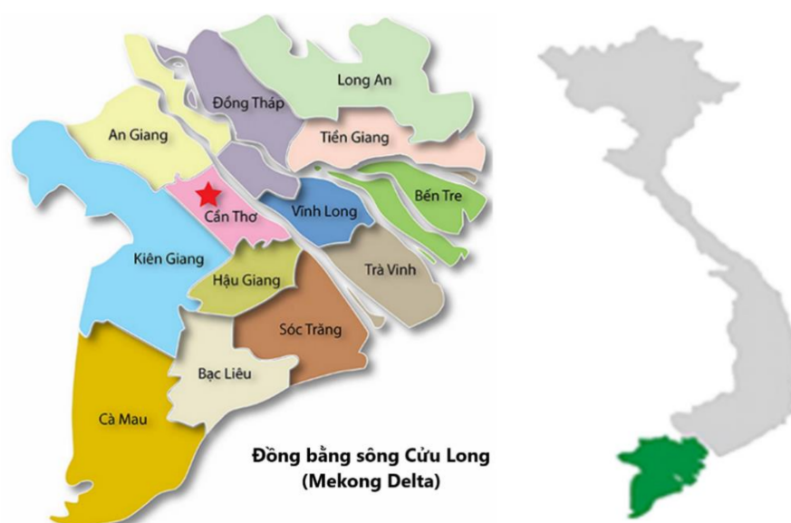
Figure 2. Can Tho City in Mekong Delta..

addition, the approval of the scheme “Building mechanisms and policies to encourage and develop public transportation in Can Tho city in the period of 2016–2020 and orientation after 2020” shows the determination of Can Tho to pursue TOD development [37]. However, how to make residents adopt and accept the new transportation system in the context of riding scooters as a habit is a challenge for the City. Therefore, exploring the factors that affect the willingness of citizens to engage in public transport in the TOD environment is crucial.