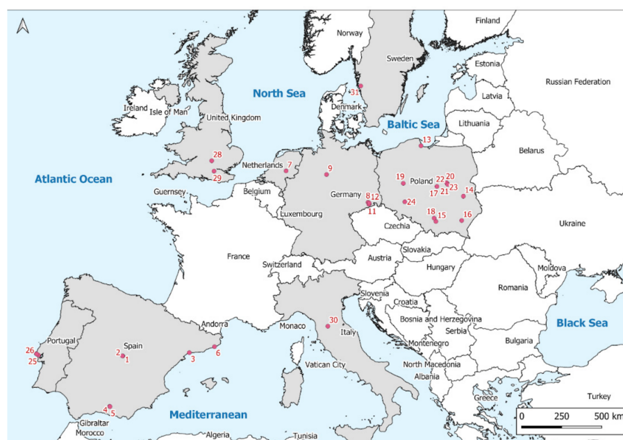
Figure 1. Map of Europe with countries where the participating gardens are located 1. Jardín del Príncipe (UNESCO Aranjuez Cultural Landscape) 2. Jardín de la Isla 3. Parc Samà 4. Alhambra (UNESCO Alhambra, Generalife and Albayzín, Granada), 5. Generalife (UNESCO Alhambra, Generalife and Albayzín, Granada), 6. Jardín botánico Santa Clotilde 7. Paleis Het Loo 8. Großer Gärten 9. Herrenhäuser Gärten 10. Barockgarten Großsedlitz 11. Schloss Weesenstein 12. Schloss und Park Pillnitz 13. Park Oliwski im. Adama Mickiewicza 14. Pałac Zomoyskich w Kozłówce 15. Zamek Królewski na Wawelu (UNESCO Historic Centre of Cracow), 16. Zamek w Łańcut 17. Pałac w Nieborowie i romantyczny park w Arkadii 18. Zamek w Pieskowej Skale 19. Pałac w Rogalinie 20. Zamek Królewski w Warszawie (UNESCO Historic Centre of Warsaw) 21. Pałac w Wilanowie 22. Park im. Stefana Żeromskiego 23. Muzeum Łazienki Królewskie 24. Pałac Kornów w Pawłowicach 25. Palácio Nacional e Jardins de Queluz 26. Parque e Palácio de Monserrate (UNESCO Cultural Landscape of Sintra) 27. Parque e Palácio Nacional da Pena 28. National Trust Waddesdon Manor 29. Royal Horticultural Society’s Wisley Garden 30. Giardino di Boboli (UNESCO Medici Villas and Gardens in Tuscany) 31. Gunnebo House and Garden.

All the participating gardens are protected and listed as national monuments or included on the UNESCO World Heritage List (individually or as part of a site). They represent almost all garden style groups: Islamic with late Medieval components, Medieval, Renaissance, Baroque, Landscape, Romantic, neo-style, and Modernist. The objects of interest are public spaces situated in city centres (8), in cities or towns (2), on the outskirts (10), and in rural areas (11).