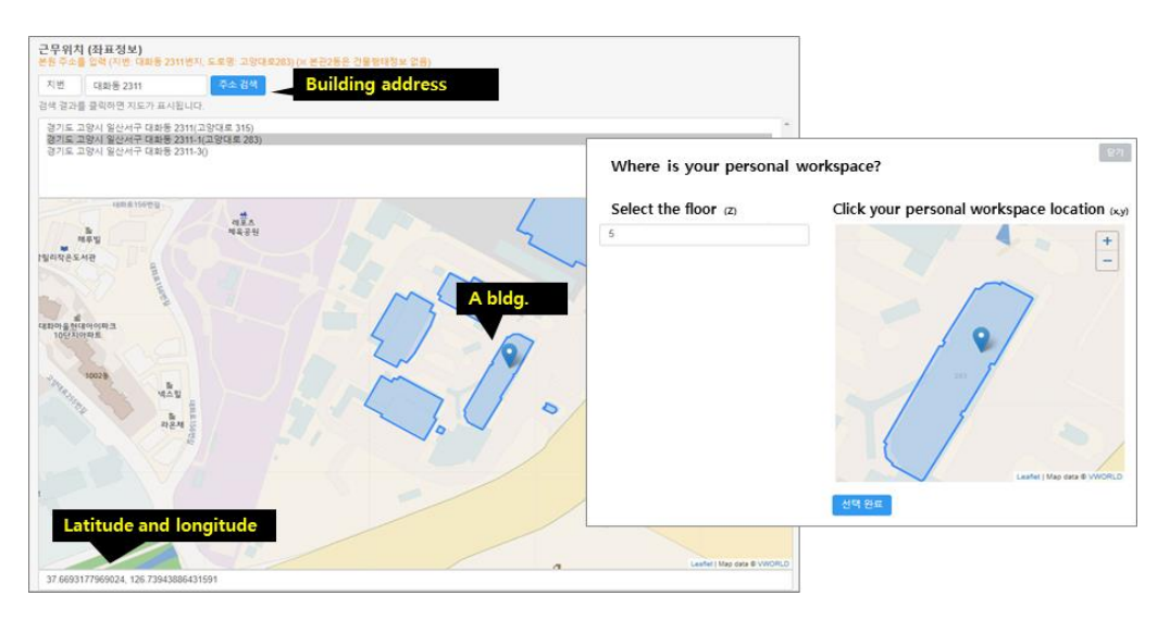
Figure 3. Example of GIS-based survey interface of the address of A_bldg and floor (latitude, longitude, floor number) of occupants in the Korea Institute of Civil Engineering and Building Technology.