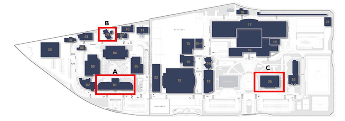
Figure 1. Location layout of the surveyed buildings (A-C).

In this study, only the web-based survey system, KBOSS, was going to be used; however, as this was a first-time survey, both the online and paper surveys were conducted in parallel to increase the participation rate of occupants and obtain the maximum number of responses on the various improvements of the system. The survey was conducted during a two-week period from 9 September to 20 September 2019.