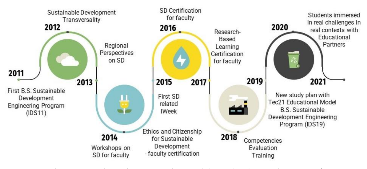
Figure 1. Outstanding events in the implementation of sustainability in the educational programs of Tecnologico de Monterrey in the last 10 years.

Then we analyzed the strategies, initiatives, and experiences that were carried out in our institution during the last ten years in reference to the objective of incorporating sustainability in undergraduate study programs (Figure 1). It is interesting to observe that in parallel, some key articles in the discussion of the role of sustainability in education coincided with the actions carried out in our university. In this way, we were able to find not only multiple contemporary developments that coincide in ideas and approaches, but also several crossings of activities and experiences in common. A brief comparative analysis is depicted in Figure 1, and the development is more detailed in the paragraphs that follow.