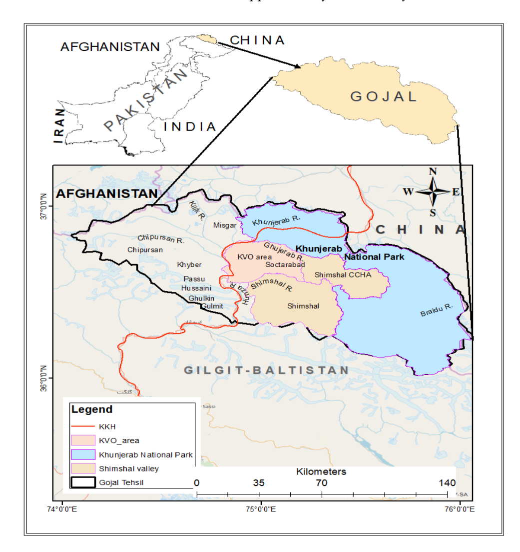
Figure 1. Map of the study area (coloured) in Gojal sub-district, Hunza, northern Pakistan.

The study area lies inside the Khunjerab National Park (KNP) and valleys in KNP's buffer zone (the Khunjerab and Shimshal valleys) in the Gojal subdistrict of the Gilgit Baltistan province, encompassing approximately 8582 km<sup>2</sup> ( 36^{\circ}33' N to 37^{\circ}01' N; 74^{\circ}52' E to 76^{\circ}02' E) [40,47] (Figure 1). The altitude of the study area varies from 2439 m to 7885 m above sea level [40,48]. Precipitations range from 200 to 900 mm per annum, and most precipitation is in the form of snow in winter. Average temperatures range from below 0 °C from October onward and rise to approximately 27 °C in May [49].