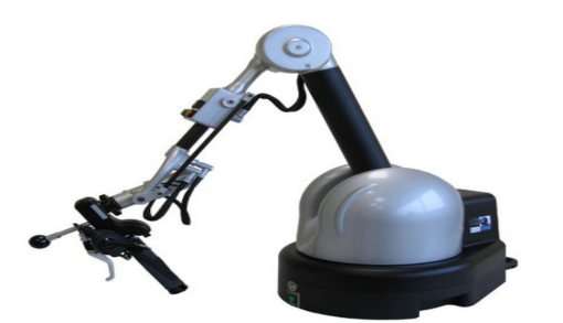
Figure 4. Haptic feedback device Virtuose 6D TAO.

Among the most remarkable equipment stands out a haptic feedback device that enabled experimentation with highly immersive interfaces to perform remotely controlled maintenance tasks in IFMIF-DONES (Figure 4).