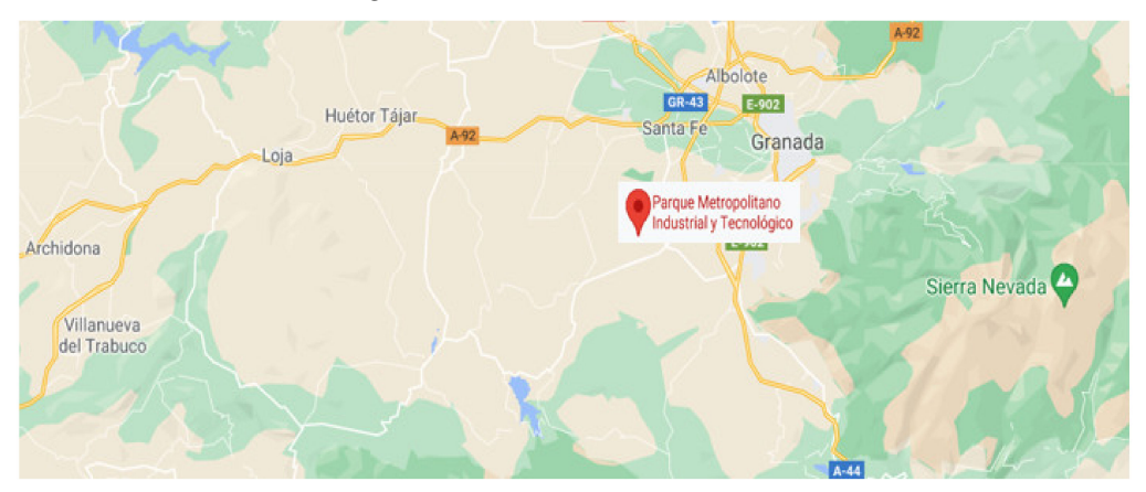
Figure 2. Geographical location of the Metropolitan Industrial and Technological Park (Escúzar, Granada, Spain).

All actions were planned to be carried out on a plot of land of about 100,000 m<sup>2</sup> located in the Metropolitan Industrial and Technological Park ceded by the Town Council of Escúzar (Figures 2 and 3).