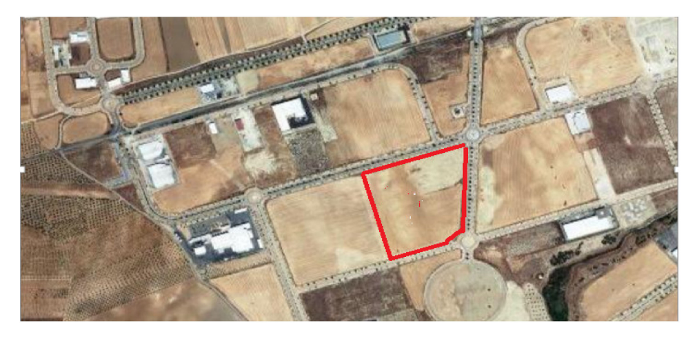
Figure 3. Upper view of the plot where IFMIF-DONES was foreseen to be built.

Among the actions to be carried out in the framework of the DONES PRIME, some of them were typical ones in constructive projects, with added attention to seismic hazards (studies of seismic activity, permanent installation of seismometers and accelerometers, seismic isolation studies for the main building, topographical surveys of the overall site, geotechnical studies of the first construction area, geotechnical surveys of the overall site). After these first steps, the planning was as follows: