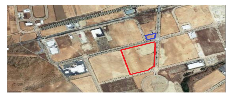
Figure 5. Upper view of the plot where IFMIF-DONES/UGR Research Centre is expected to be built (in blue).

This centre is to be set up on a 4500 \text{ m}^2 plot of land located next to the accelerator facility (Figures 5 and 6). This line covers everything from the acquisition of the plot of land to the project design, project management and construction of the building.