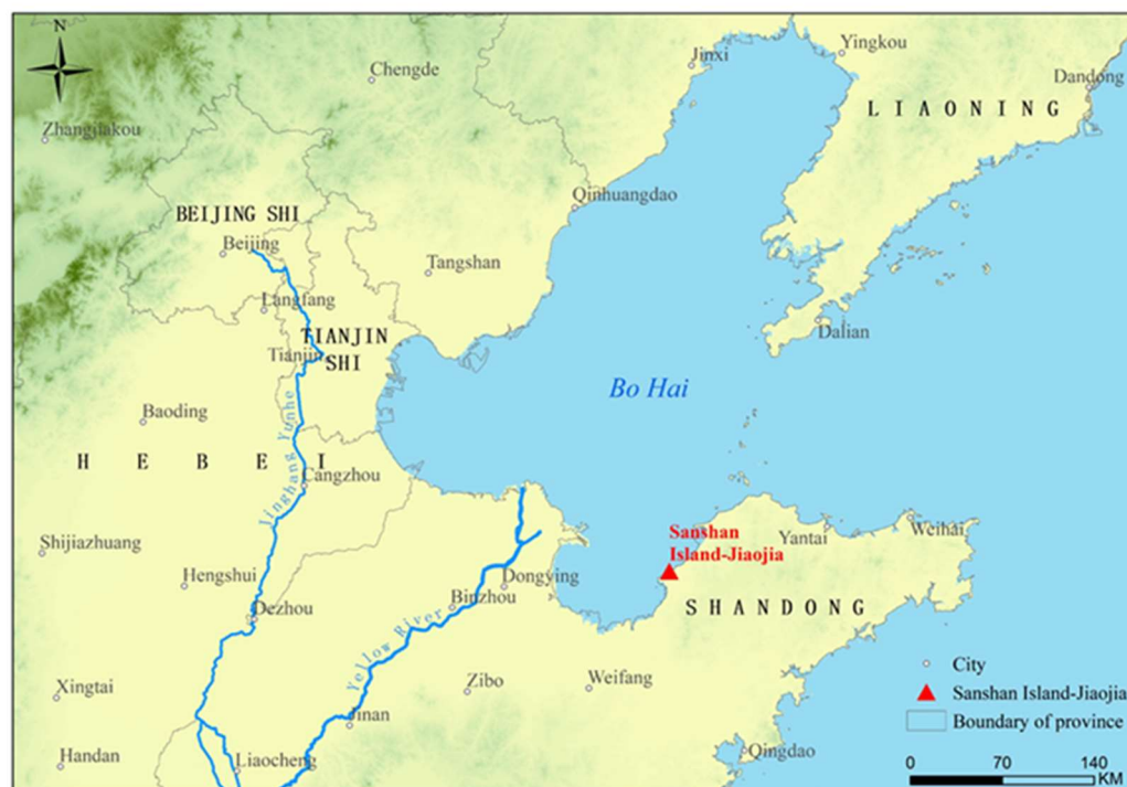
Figure 1. Laizhou Bay. The red triangle mark is where Sanshan Island-Jiaojia is located.

It is noteworthy that Laizhou Bay is located in the southern part of the Bohai Sea and the northern part of the Shandong Peninsula (Figure 1, charted by Arcgis 10.2). It is the largest semi-enclosed bay in the Bohai Sea. The water depth in the basin is relatively shallow, and the Yellow River brings many nutrients. It is one of the spawning and feeding grounds for the three major marine organisms in the Yellow and Bohai Seas. The coastline of Laizhou Bay and the sea area belong to Kenli County, Dongying City, Shandong Province, Shouguang City, Hanting District, Weifang Laizhou City, Zhaoyuan, and Yantai City.