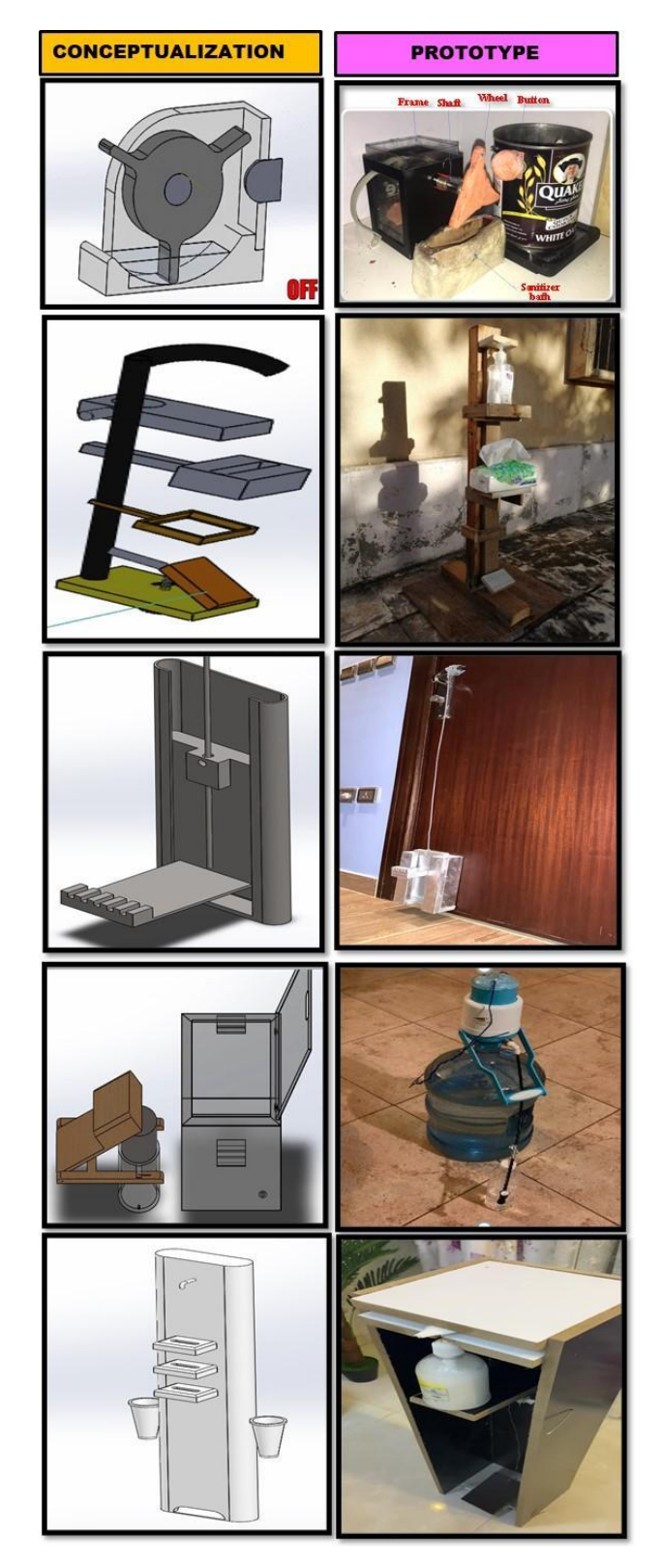
Figure 4. Conceptualized and developed prototypes by the various teams.

four questions: Scope—what do you intend to design; Significance—why do you intend to design; Methodology—how do you intend to design; Timeline—when do you intend to finish the design? The students learnt about the procedures for conducting feasibility studies of their design in terms of cost, functionality, ease of manufacturing and overall usage relative to the community.