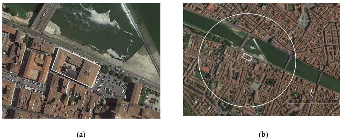
Figure 3. (a) and (b) Localization of the site and walkable catchment centered on the barracks.