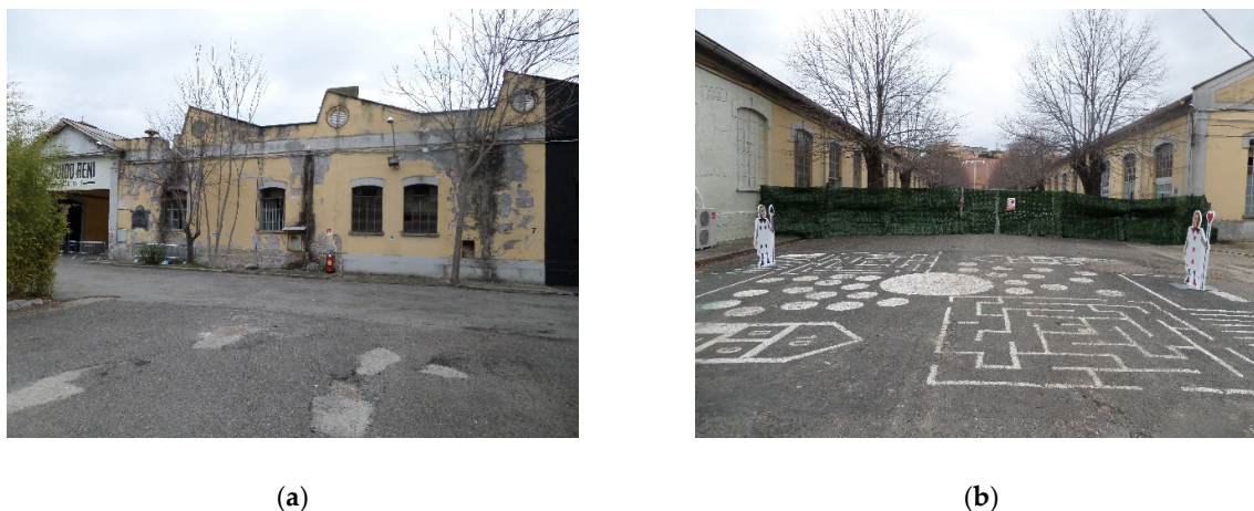
Figure 8. (a) and (b) Two views of the Guido Reni barracks spaces and their temporary reuse in 2017.