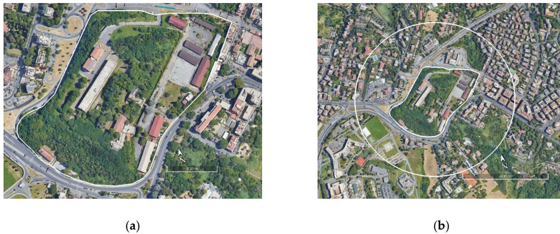
Figure 7. (a) and (b) Localization of the site and walkable catchment centered on the barracks.