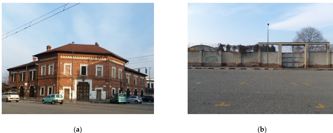
Figure 12. (a) and (b) Two views of the M.Ar.di.Chi. warehouses. (a) The U-shaped building and (b) desolated military walls.

This former military barracks is located on Turin's northeast outskirts, in the historical working-class neighborhood "Barriera di Milano". This area is currently waiting for its regeneration under the 2010 General Master Plan Modification and the 2008–2011 large urban project of about 880,000 m 2 called "Old Vanchiglia Railway Yard" [99]. The barracks surroundings have plenty of other abandoned and degraded large public properties, i.e., the post office in Monteverdi Street, the military warehouses in Cimarosa Street, and the Vanchiglia railway yards. While the presence of urban voids is significant in this neighborhood, the nearby former 90,000-m 2 Tobacco Factory, Manifattura Tabacchi, is an outstanding example; this zone presents a mix of activities within a radius of 400 m. These functions are mostly meant for the lower social classes, i.e., commercial shops, factories and warehouses, social housing, an employment center, a football stadium, and the Turin's Red Cross headquarters.