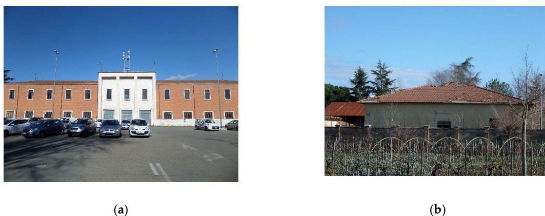
Figure 4. (a) and (b) Two views of the Lupi di Toscana barracks: (a) The Military Command Building and (b) one of the degraded mono-functional pavilions.

The Lupi di Toscana–or Gonzaga–barracks (Figure 4) was built during the 1940s in the southwestern outskirts of Florence, having an urbanizing effect on the neighboring area in the second half of the 20th century. Officially made redundant in 2008, the ancient barracks are currently suffering open spaces and existing built environment deterioration. After the 2014 draft agreement between the City Council, Ministry of Defense, and State Property Agency, the property was transferred to the City Council through the state property federalism in 2015 [69]. Based on a participatory process called “Not Homes but City” [70], an International Urban Design Ideas Competition for the creation of an opportunistic-risk-profile new residential settlement was launched (October 2016–July 2018) [71]. Notwithstanding the failed hypothesis to convert the military compound into a mosque in 2017, the 2018 winning project aimed to demolish all the existing architecture apart from the Command Building. The new morphology will be new 3-to-5-floor residential buildings (60%), the ground floor of which will be for commercial, handcraft, social, and tertiary functions (40%) for a total new gross floor area of 53,000 m 2 [72]. The current situation is on stand-by for two reasons. First, the City Council should approve the General Master Plan Modification and, second, there is no real estate investor willing to invest in this large urban project.