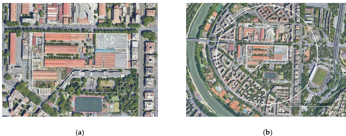
Figure 9. (a) and (b) Localization of the site and walkable catchment centered on the barracks.