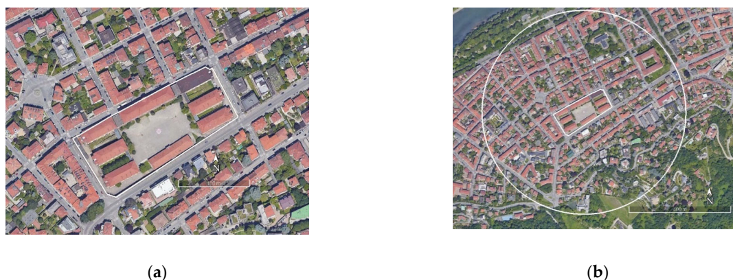
Figure 11. (a) and (b) Localization of the site and walkable catchment centered on the barracks.

The barracks morphology resembles the formal structure and building organization of Borgo Po, set up by an orthogonal grid scheme generating a diversity of rectangular blocks. The reticular layout came from both the land parceling and the large existing public spaces, such as Great Mother of God square—Piazza Gran Madre di Dio. As Borgo Po is a typically bourgeoisie-shaped neighborhood, the functions located within a radius of 400 m are mostly residential. The buildings' ground floors are dedicated to commercial and workshops and the blocks are occupied by mostly private gardens. The accessibility to the city center is made possible by two bridges while the existing transportation infrastructures favor private cars as the primary mode of mobility. Nevertheless, Borgo Po neighborhood is provided with a functional bus transport system.