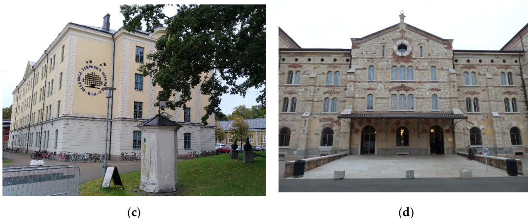
Figure 1. (a), (b), (c), and (d) Former military sites converted into University. (a) The former military hospital converted into the School of Architecture in Granada (Spain); (b) the former Roger de Llúria barracks converted into the Pompeu i Fabra University in Barcelona (Spain); (c) the Gräsvik military area converted into the BTH campus in Karlskrona (Sweden); (d) the former Santa Marta barracks is nowadays Università degli studi di Verona's center.