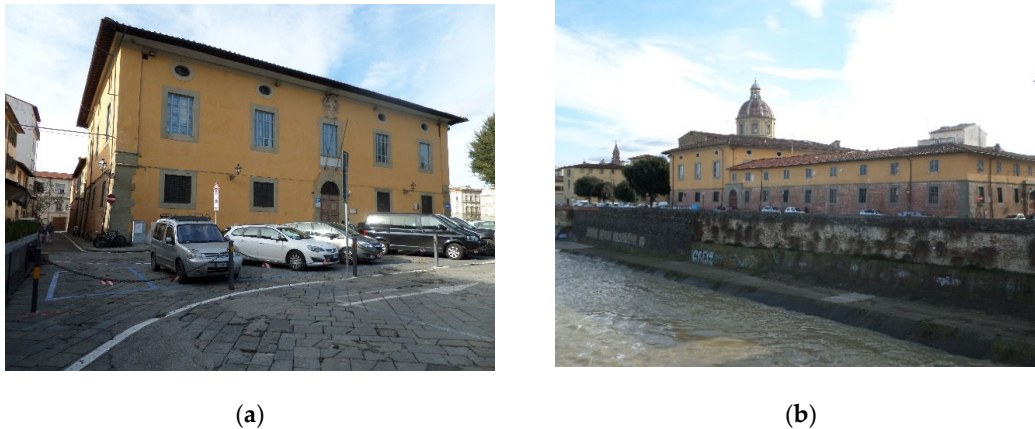
Figure 2. (a) and (b) Two views of the Cavalli barracks.

tertiary and 5% for commercial uses) that will result in the “House of Florentine and International Start-ups” [66]. The aim is to provide a “Digital Square” on the ground floor opened to local citizens and permeable on both sides of the site, offering perspectives of the neighboring Piazza del Cestello. Notwithstanding the left-wing political party “Sinistra Progetto Comune” protests to demand proximity shops and activities for the repopulation of Florence’s Historic Center [67], the works are expected to end by early 2021. The profitability of this operation will be the cost of renting the co-working spaces, which will be around 200–250 euros for each space [68].