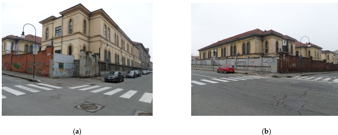
Figure 10. (a) and (b) Two views of the La Marmora barracks. Source: Federico Camerin (2017).