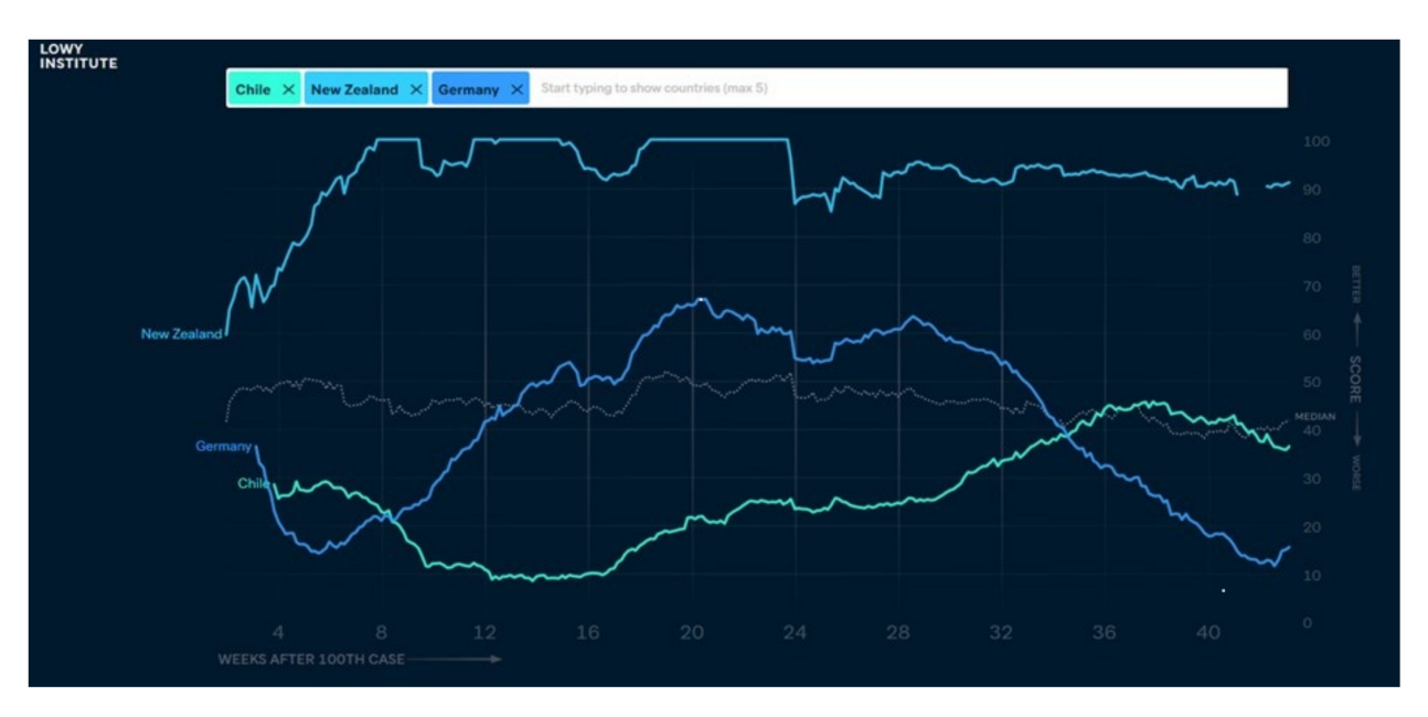
Figure 2. Graph comparing Chile's, New Zealand's and Germany's performance regarding managing the COVID-19 pandemic during the 43 weeks following the 100th confirmed COVID-19 case [57].

around the world suggests that, indeed, there is potential for cross-county learning when looking at Chile, New Zealand and Germany (Figure 2). Differences between those countries are certainly not explained by, e.g., geography (New Zealand's remote island location) alone. However, the graphic is a representation of data available up to 13 March 2021 and does not include vaccination rates [57]. Higher values on the y-axis in Figure 2 indicate a better overall performance in managing the COVID-19 pandemic.