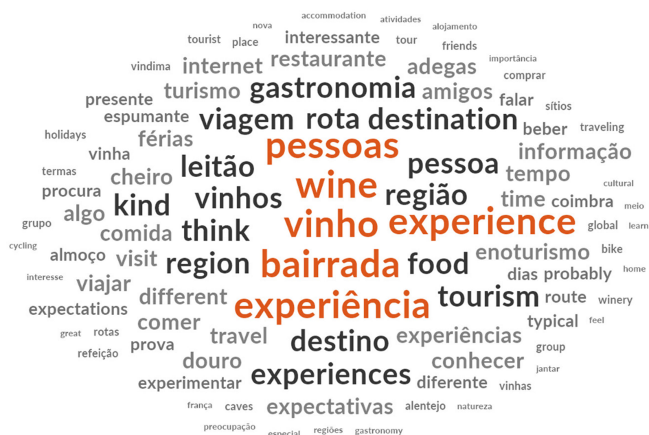
Figure 1. Word Cloud.