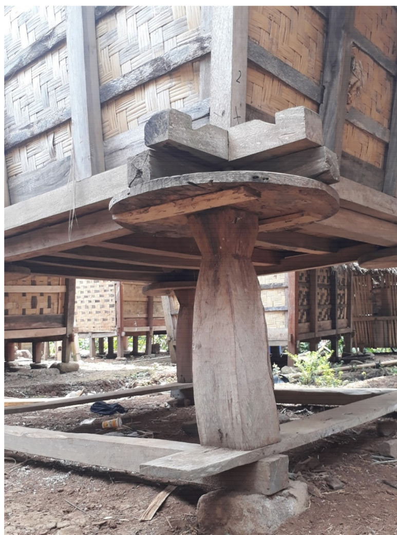
Figure 2. Leuit lenggang with a geuleubeug in a Baduy dalam village.

stalks) and hanging them on a long bamboo pole. Dried bunches are then kept in small bamboo-walled barns called leuit , made only from wooden materials. The Baduy build these barns on stilts with a mechanism to protect the stored harvest from rats and other rodents. The rat protection mechanism is made of wooden discs called geuleubeug , which are placed on top of the leuit stilts to make it physically impossible for rodents to reach the inside of the barns. These wooden discs are large enough that the rats have no possible way of climbing past the leuit leg. They may attempt to crawl horizontally on the downside, but that side is made very slippery so that no rat can crawl upside-down and reach the edge (see Figure 2). That way, rats are kept at bay without incurring any risk of being killed. The so-preserved rice can remain unattended for a long time, which can reach 50 to over 90 years (Rice barn harvest can even be inherited from one generation to the next [63]).