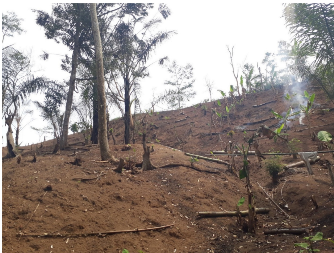
Figure 1. Huma fields prepared for sowing rice.

surplus production that would justify the need for unnatural fertilizers. They find it sufficient for their crops to use their own home-made fertilizers which are produced with organic ingredients (Organic fertilizers are generally made from dried leaves ( koleang ) and forest humus ( surubuk )). Soil fertility is also achieved through the practice of cutting and burning bushes to make the minerals contained in the ashes and charcoal available for rice growth (see Figure 1). This burning process plays an important ecological role, since a substantial proportion of the mineral energy that feeds the crops comes from burned forest ashes (see also [5]). The crucial ecological importance of this forest burning process is comparable to the swidden cultivation practiced by the Karen tribespeople in northern Thailand, as documented by Nakashima and Roué [5], or the customary mosaic burning practices of various aboriginal population groups of the Northern Territory in Australia, as documented by Ens et al. [48]. Such controlled forest burning is also widely known for its use in helping manage the forest biodiversity and in mitigating the risks of wild forest fire.