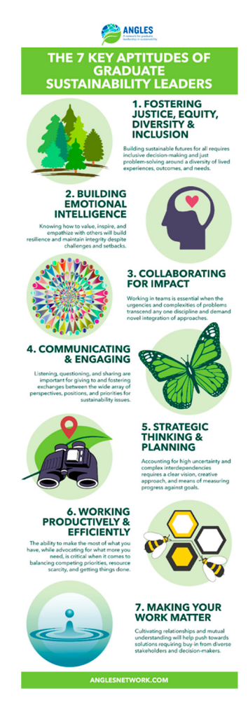
Figure A1. The 7 Key aptitudes of Graduate Sustainability Leaders. (Available online: https://anglesnetwork.com/angles-aptitudes).