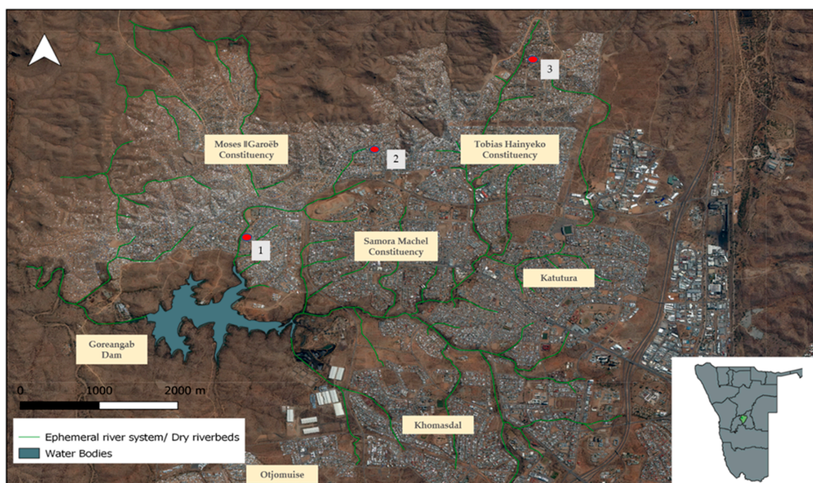
Figure 2. Map of study site in Windhoek, Namibia. The area of interest for this study lies in the informal settlements, which are located on the outskirts of the Moses ||Garoëb, Samora Machel, and Tobias Hainyeko Constituencies. (1) Location of Greenwell Matongo C informal settlement, bordering Goreangab Dam, where one focus group was held. (2) Haka-hana community centre near Havana informal settlement, where another focus group was held. (3) Okuryangava with surrounding informal settlements, one of the areas where transect walks were carried out. The image shows unplanned sprawl extending towards the north and northwest, as well as hilly terrain surrounding the city.