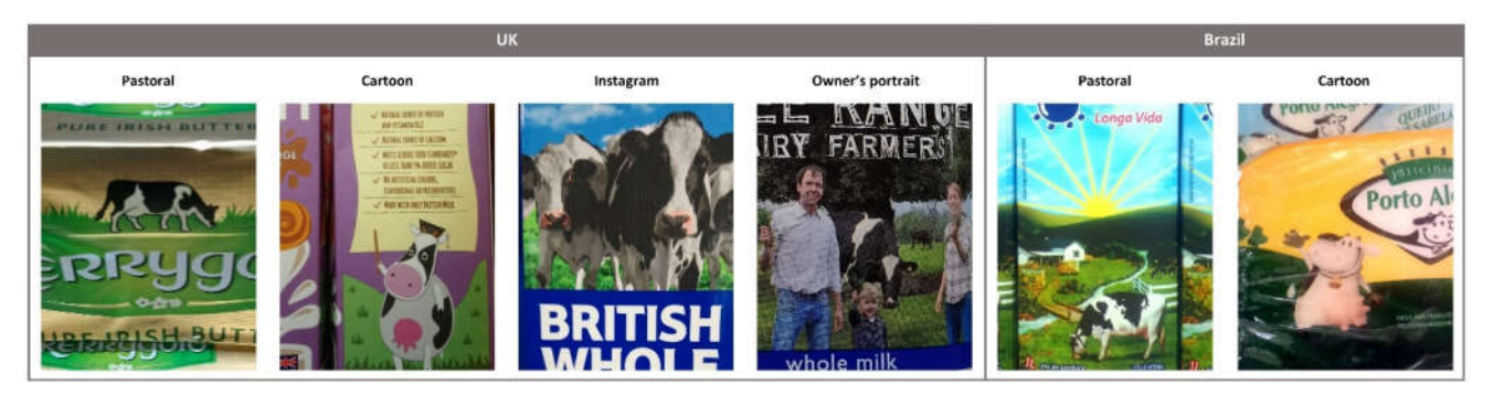
Figure 2. Examples of images from each modality of cow reference by country.

was included in the analysis where it was an integral aspect of the cow imagery (e.g., as a speech bubble). Other written text on the packaging was not included in the analysis.