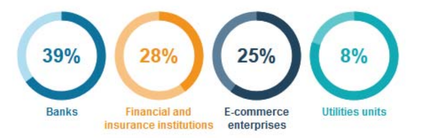
Figure 2. Distribution of surveyed companies by business profile.

The next step (Step 4) of the research process involved surveying the representatives of Polish service enterprises. The research was conducted among 110 representatives of Polish banks, financial and insurance institutions, media, utilities units and e-commerce enterprises. The survey was directed to the management staff, mainly chief technology officers, chief information officers, chief operating officers, heads of back offices, security, financial and sales departments as well as other employees responsible for technology and development of enterprises operating in the service sector. Figure 2 depicts the distribution of the service companies by business profile.