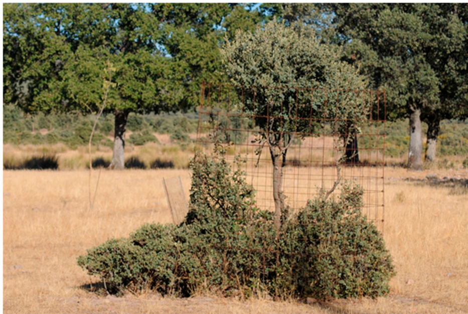
Figure 3. Protection of two stunted multi-stemmed individuals of oak ( Quercus ilex ) with a strong wire fence (2 m high). Only part of the oak multi-stemmed individuals was protected. Pictures show a comparison between the protected part and the original part (non-protected oak multi-stemmed individuals): (a) cylindrical shape of the protected part of the multi-stemmed individuals, showing an increase in height (>2 m high) and no pruning was carried out; and (b) small tree generated from a multi-stemmed individual after partial protection and pruning of the basal sprouts. The following Photos: Ramón Perea.