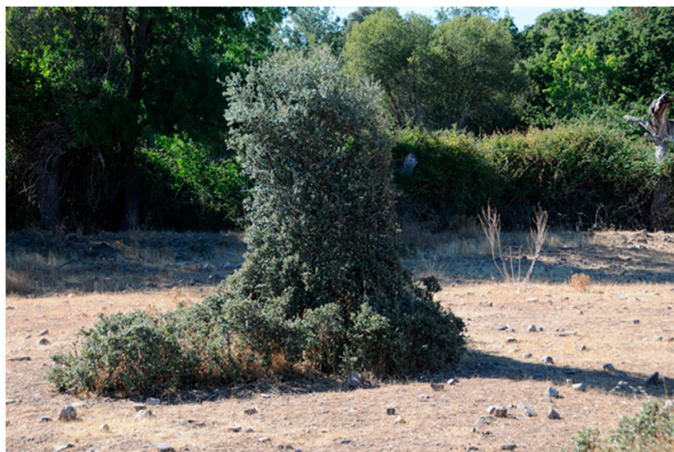
Figure 3. Cont.