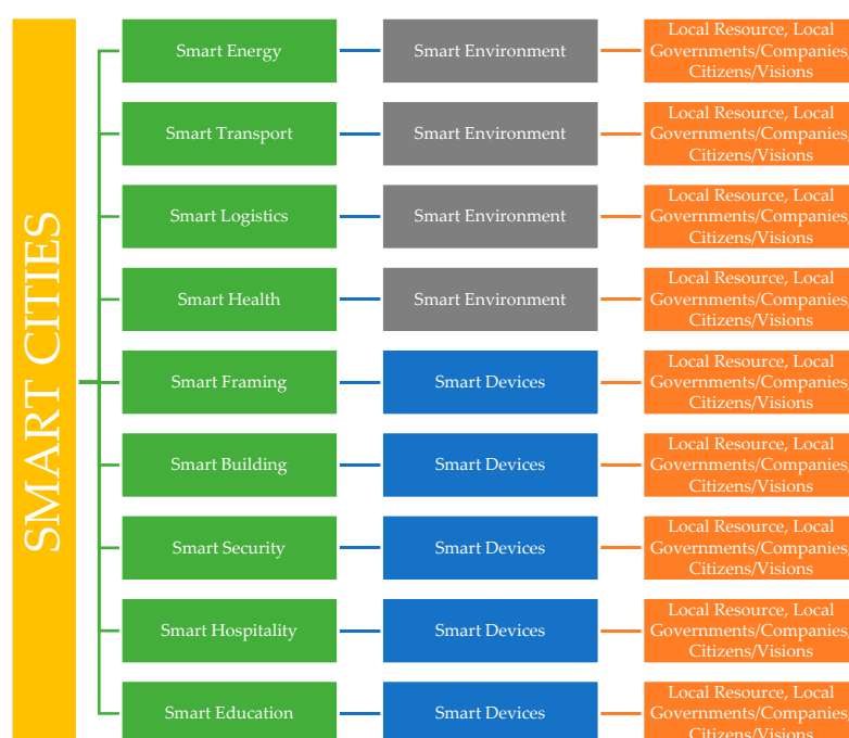
Figure 1. Shows the hierarchical structure of application areas related to smart cities [16].

Additionally, Table 1 shows the previous investigations related to EVs and GBs by different researchers. As can see the key role of renewable energy for smart city development is significant in these studies.