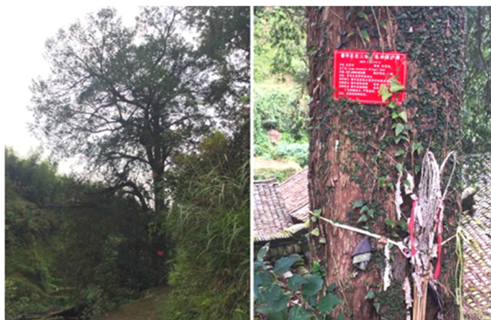
Figure 15. Ancient trees in Liufang village.

The Dong people worship tree gods and believe that tree growth and leaf falling are encouraging signs. They even restrict the villagers in village rules and regulations and punish the destruction of forests. The villagers plant more “auspicious trees” at the village's edge to form a “Fengshui forest” to protect the village's safety. Fengshui trees are also planted near the stage, wells, or other public places, which can watch the prosperity of the village and provide shading as well. There are three kinds of ancient and famous trees in Liufang village, about 30 of which are well preserved (Figure 15). There are also relevant contents in the village's agreement to restrict this, in case someone destroys the ancient trees. The villagers believe that these old trees can ward off evil spirits. They are the patron saint of the Dong village and have been guarding the Dong family for generations.