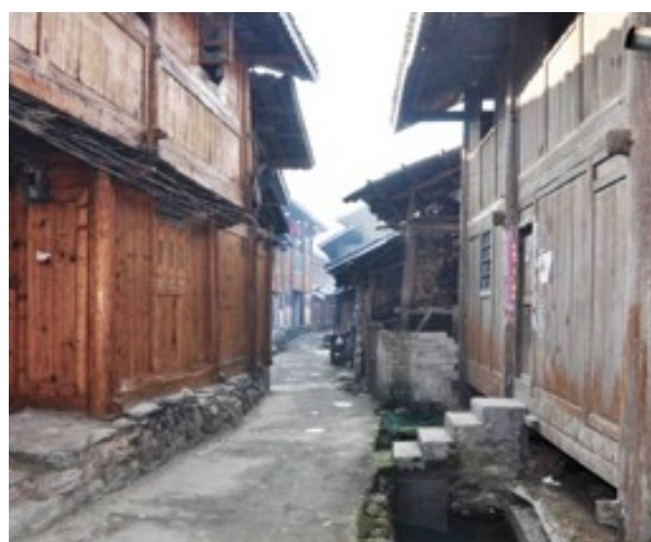
Figure 3. The street pattern of Liufang Village.