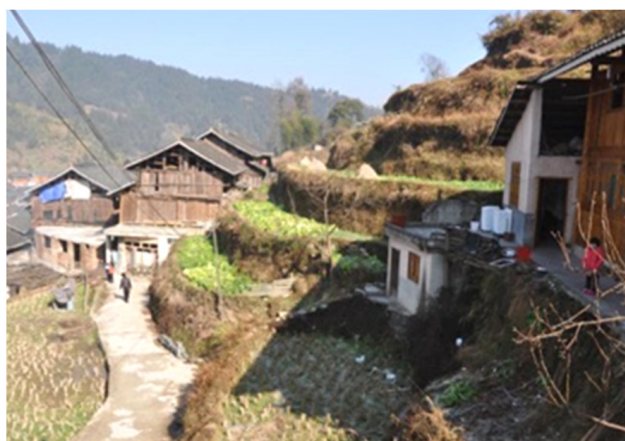
Figure 12. Terraces in Liufang Village.

The cultivated area of Liufang village is 1040 mu, with an altitude of 670. Rice fields can be divided into two types. One is relatively flat around the village’s foot. The other is built layer by layer along the village’s slope called terraces (Figure 12). It is constructed along the contour lines of high field stem and then extended along the left and right mountains, flattening landmarks, thus forming a horizontal slope field. Then, a second slope field is gradually built, and each paddy field roughly presents a strip.