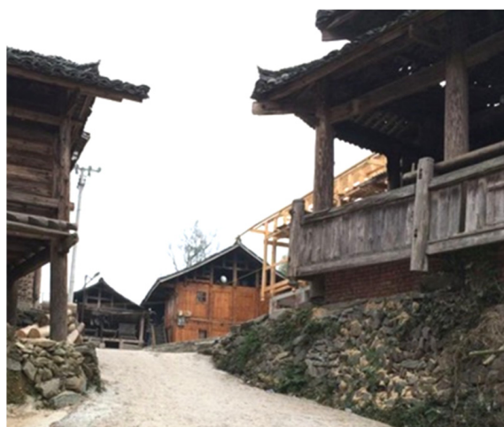
Figure 9. High foot building in Liufang village.

Most of the high foot buildings in Liufang village stand on the half slope hill (Figure 9). If the slope is large, the back part of the house is directly erected on the slope sill, and the front part is elevated with wooden columns or connected with wave columns according to the terrain. It is similar to hanging columns, which is called "Diaojiao House". Most of the houses are two-story buildings. The first floor is relatively low and does not have a deck slab. Farmers directly use the ground to stack farm tools and raise poultry. The second floor is the principal living place.