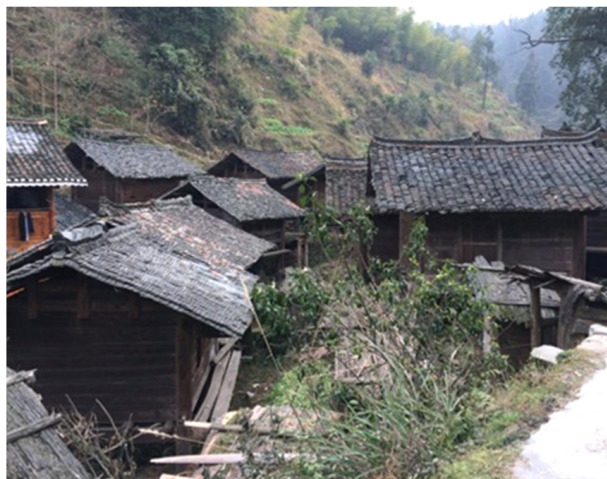
Figure 10. A low-foot building in Liufang village.

of which is used for storing sundries, and the other half as the bedroom. The rooms on both sides of the building are mainly used for cooking pigs and cattle. Livestock pens are usually set up on the terrace behind the house.