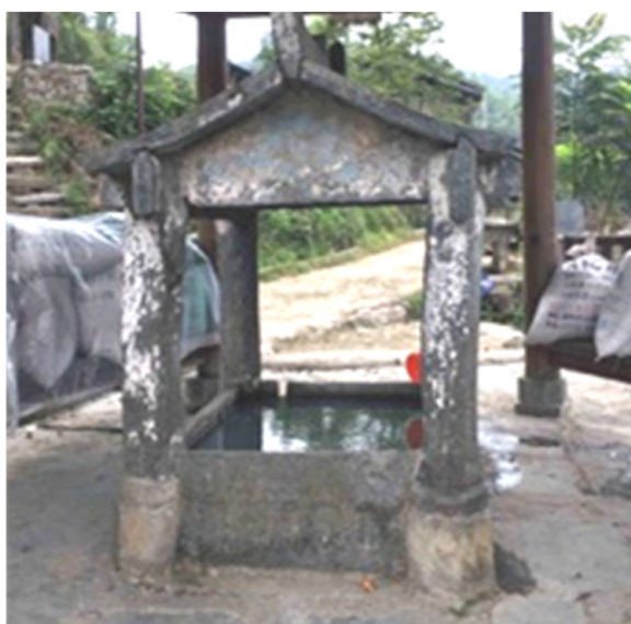
Figure 7. Kangning well.