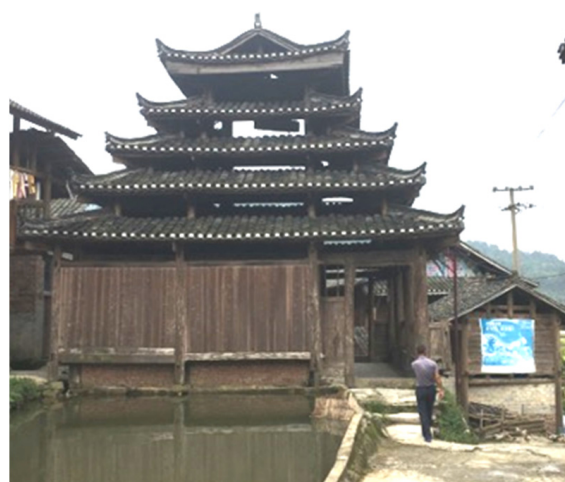
Figure 4. Drum tower of Liufang Village.

In addition to the drum tower, there are some essential nodes of pattern in the Dong Village: gate, flower bridge, pond, granary, well, pavilion, etc. They form public and attractive communication spaces for residents' life. The entrance gate is one of the characteristic buildings in Dong village, which marks the border of the village and protects villagers' safety and property (Figure 5). It is usually built on the main road connecting the village with the outside world, and the construction technology also adheres to the wood construction skills of the Dong nationality. Moreover, the Fengyu bridge has the function of rest. It adopts the corridor bridge form, with eaves on the wooden bridge and seats for passersby to rest. There is a Fengyu bridge in Liufang village, named Mum's flower bridge of Liufang village (Figure 6). It was built in the Qing Dynasty. Due to disrepair and severe damage, it was rebuilt in 2005 and is still intact [37].