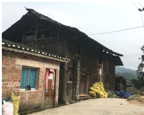
Figure 11. A flat building in Liufang village.

The flat buildings in Liufang village are mainly built on flat ground, directly with soil compaction or sandy soil as the ground, without an overhead heat- and moisture-resistant layer (Figure 11). The first floor is mainly for people to live in. The second floor is primarily for drying clothes and stacking sundries and has few bedrooms. Spacious porches are usually built in front of the flat houses. Aside from this feature, the first floor's functional layout is similar to that of the low-foot building.