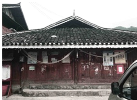
Figure 13. The stage of Liufang.

Dong opera and song of Dong nationality are also closely related to farming. All of them embody strong traditional rice culture. They are usually performed on the stage or drum tower ground in the village or in an open place. There is no special arrangement, and the performance is relatively simple. The costumes and props are ordinary or slightly beautified from the daily necessities of the nation. The stage of Liufang village's performance center is built in the activity site of Liufang village, covering an area of 60 square meters. It was built in 1998. The building is well preserved, with exquisite modeling and carving (Figure 13). There are wood carvings and colored paintings on the forehead of the stage. The top of the stage is made of local green tiles [37].