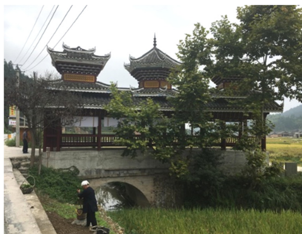
Figure 6. The Mum's flower bridge of Liufang village.