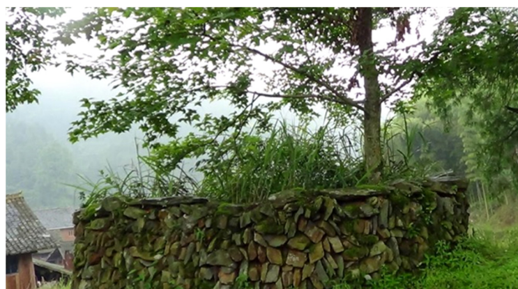
Figure 16. Sa altar of Liufang village.

The Dong people worship “Sa,” believing that she is the perfect and beautiful guardian goddess and the highest idolatry of the ethnic group. From the first day to the seventh day of the first lunar month, “Sa” is sacrificed in the Sa altar, which is as important as the Dong village’s drum tower. It is the belief center of Dong people in one village. It is mainly built in the center of the village or the secluded place [39]. The Sa altar in Liufang village is located on the hill behind the ancient gate of Liufang village (Figure 16). It was built in the Qianlong period and is made of different size stones. The specific construction age is unknown. It is mainly to commemorate and protect the villagers and pray for blessings. During the spring festival, all the villagers go to Tanggong’s house to offer incense and pray for Tanggong to bless the village’s peace and the people. For hundreds of years, it has been admired from generation to generation and has been handed down to this day.