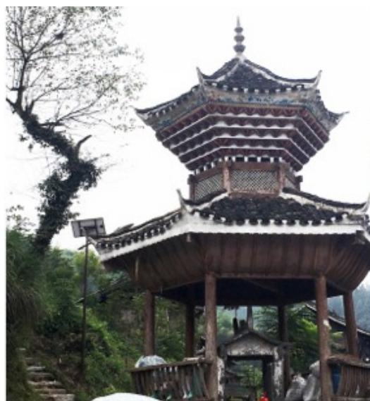
Figure 8. Kangning well Pavilion.