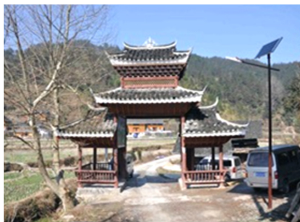
Figure 5. The new gate of Liufang village.