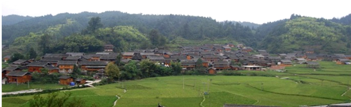
Figure 2. Typical village landscape of Liufang village.

Liufang village is a typical Dong nationality village. According to the dialect and cultural characteristics of the Dong language, Dong areas are divided into South Dong and North Dong. Liufang village belongs to South Dong. For a long time, the Dong people in the southern region have lived together with inconvenient transportation [28]. They are less affected and impacted by the external Han culture. They retain the original cultural form of the Dong people and show the essence of the Dong culture. Liufang village, as a southern Dong village, remains the whole Dong culture. The village landscape space and traditional culture continue well (Figure 2). It is rich in tourism resources and lasts the traditional rice farming mode. It is one of the first villages selected as traditional Chinese villages in Liping County in 2012.