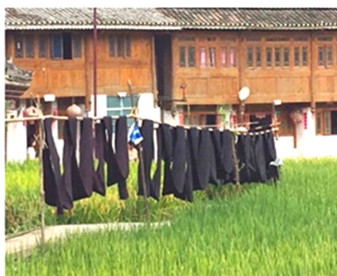
Figure 14. Dong cloth.

The clothing culture of Dong nationality is also the reproduction of rice culture. As the main source of spinning and weaving, cotton and dyed indigo come from farmland and are the main economic crops in Dong township. In the past, people seldom went to the market to buy clothes, and the sources of clothing materials are all from their cotton and textile. Dong cloth is solid and durable with a tight pattern (Figure 14).