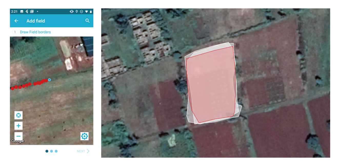
Figure 3. Image on left shows the 'follow me' function, introduced by 6th Grain in its FieldFocus Light application, which enables users to walk around their fields to digitize the area. On right, three digitized outlines near Kimbimbi, Kenya of the field showing a difference of less than 2 m of the centroids of the three fields. A full-scale validation of the area and centroids of the data captured in this way is forthcoming.

Assessing yield affordably will require the use of Earth observing data, social media and innovative mobile chatbot technologies. The private sector can train a large base of smartphone-owning farmers around the world to create field boundaries to estimate field size. New yield models are needed to estimate the likely impact of weather shocks on outcome. Small growers can digitize their field by walking around it, capturing GPS points which are sent to a server, together with crop, variety and date planted information (Figure 3). An example of this is shown in Figure 3, provided by 6th Grain and its partner Tetra Tech, funded by the Bill and Melinda Gates Foundation. It was found that when fields were digitized by an untrained small grower and an agronomist with Android phones, they can reproduce field boundaries to within 10% of area and centroid distance of 2 m of each other, well below the geospatial accuracy of Sentinel 2a/b [34].