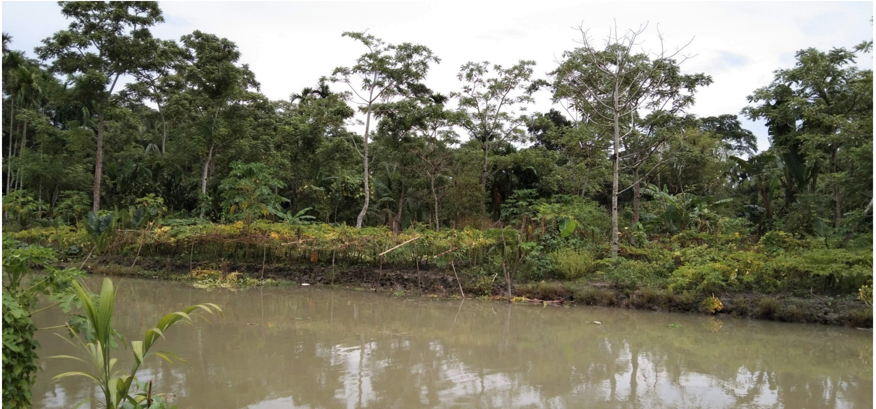
Figure S3: Sorjan (Ditch and dyke) practised in Barishal