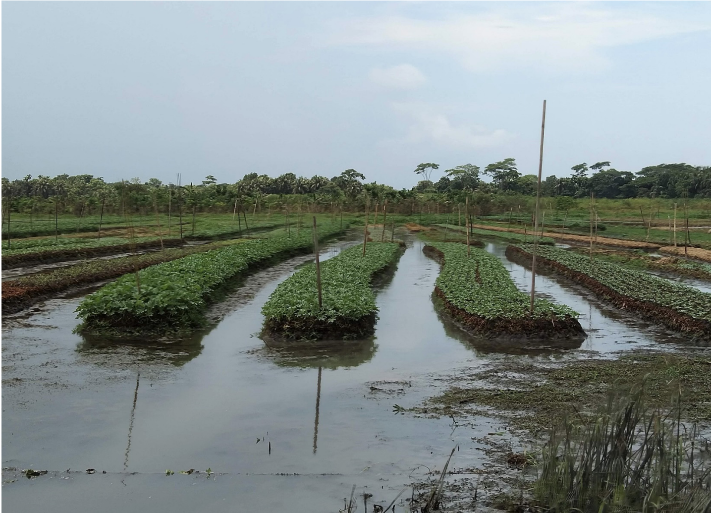
Figure S2: Floating bed agriculture practised in Barishal