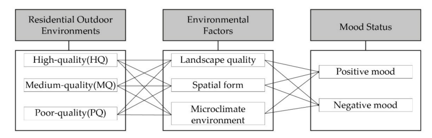
Figure 1. Potential association between mood status of the elderly and residential outdoor environments with different quality.

Based on the literature review, we attempt to compare mood in older people among the three types of residential outdoor environments and examine outdoor environmental factors affecting mood in this study. Therefore, we proposed a framework as shown in Figure 1; three different qualities of residential outdoor environments were constructed: high quality (HQ), medium quality (MQ), and poor quality (PQ). Environmental factors of landscape quality, spatial form, and microclimate environment were included in the research. Positive and negative mood were used to assess the mood status of the elderly. We hypothesized that residential outdoor environments have an impact on mood in the elderly and that this relationship differs with the types of outdoor residential environments.