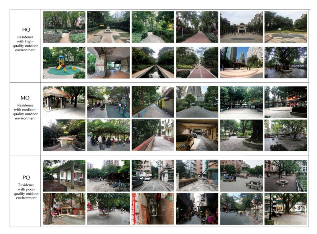
Figure 2. Three types of residential outdoor environments with different qualities.

each participant at the start of the interview and assured that their private information would not be divulged and all the data would only be used for academic purposes.