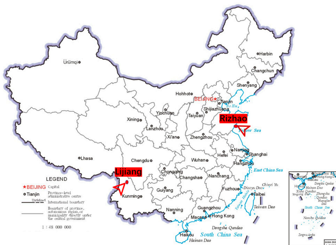
Figure 1. The geographical location of two case areas.