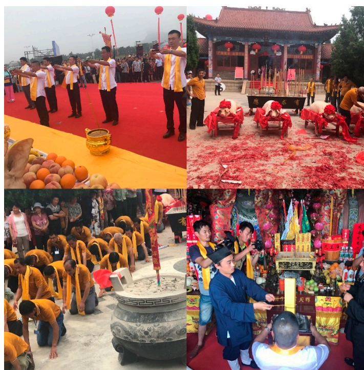
Figure 5. Festivals in Rizhao.

Rizhao is well-known for more than its maritime industry. Located in an area of great antiquity, Rizhao is rich in cultural assets, both tangible and intangible. Of the former, the best examples are the Longshan and Dongyi cultures, from which a wealth of historic artifacts has been unearthed. Of the latter, examples are the traditional sun-worship rituals which developed from these early cultures, as well as the rituals of the Fishermen's Festival, mainly the four dances, briefly described below (Figure 5). Its geographic location beside the sea, together with an abundance of sunshine, has made the city a major tourist destination, while its green credentials also make it a target for green tourism.