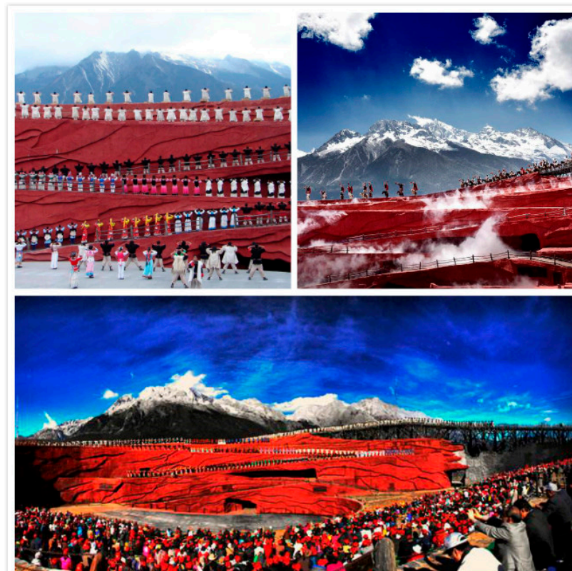
Figure 2. Impression Lijiang Dance Performance.

Road” passing through the city and performing in the “Impression Lijiang” gala, local rural peasants in Hai Village voluntarily organized the Hai Village Tourism Cooperative, developing a tourism program for tourists to experience the ancient transportation mode. As of 2008, 140 out of the 160 rural households have joined the cooperative. The average number of horses per household reached three in 2008. By investing in horses in the cooperative, the households receive dividends from the cooperative [79]. The success of this cooperative caused surrounding villages to follow suit and established more than 10 cooperatives, thus shifting the rural development model from being agro-based to cultural-oriented village-based.