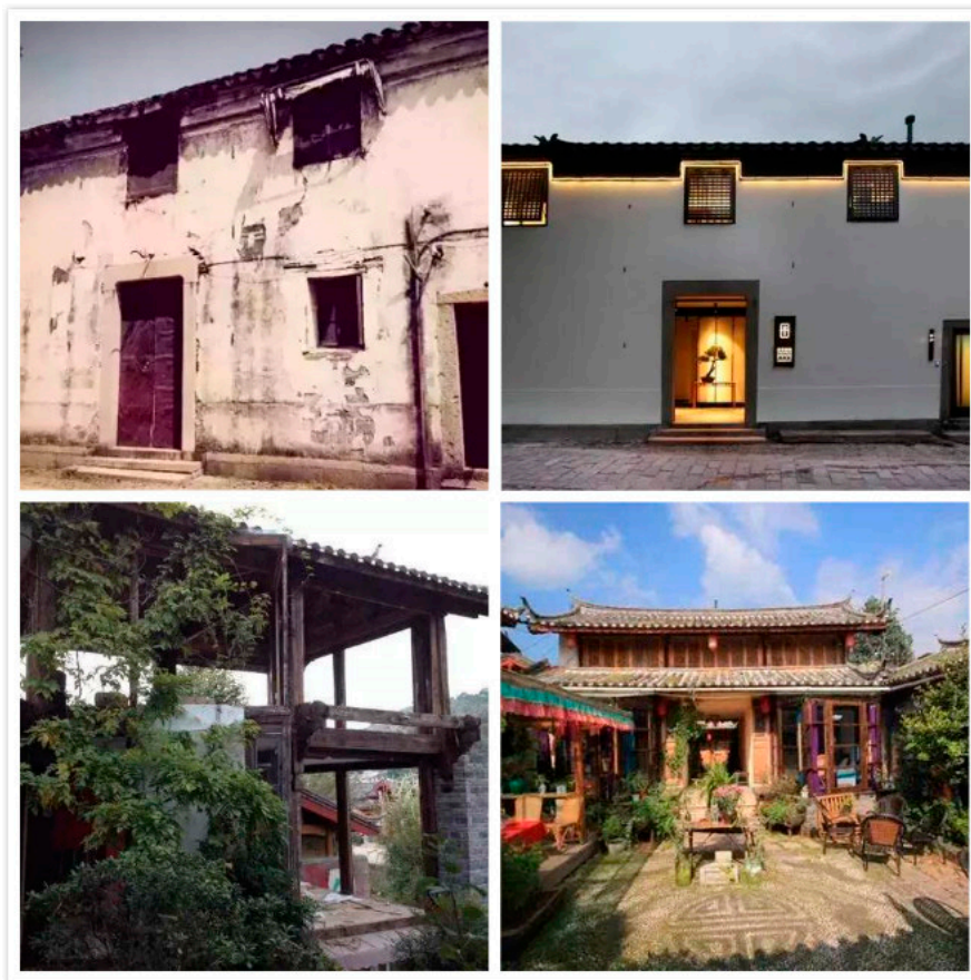
Figure 3. Refurbishing Old Rural Houses in Lijiang.

houses into home-stay hotels furnished with local flavour to emulate the style made popular in the “Impression Lijiang” performance (Figure 3).