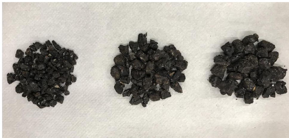
Figure 1. Epoxy RAP particles used in this study.

Since the cured epoxy RAP binder cannot be fully recovered and reused as a binding material in new HMA, epoxy RAP materials containing epoxy asphalt and aggregate were added directly to new HMA in this study. Epoxy RAP particles have aged epoxy asphalt at their surfaces, as illustrated in Figure 2a. After mixing with new aggregates and binder, it is expected that epoxy RAP particles will be coated with a virgin asphalt binder, as illustrated in Figure 2b.