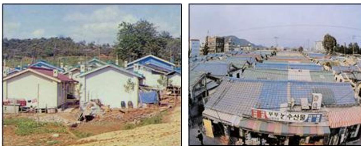
Figure 1. Houses built in Bokumjari village in 1980 (left) and houses in Bokumjari village after 20 years (right) [49].

to play an important role when the slum was about to be demolished to build a motorway along the riverside slum areas. At the time, the tenants could not get any compensation for the demolition of the slum [48]. The activists organized tenants who were willing to develop a new settlement together. In 1977, 170 families from the slum developed a vision using their own hands (see Figure 1). A loan of US$100,000 from Misereor, a German Aid fund, was used for land acquisition, communal purposes, and housing construction [47]. The loan was repaid in two years. After that, Misereor decided to use the fund to build other community-based villages, Handok and Mokwha, for evicted people in succession [47].