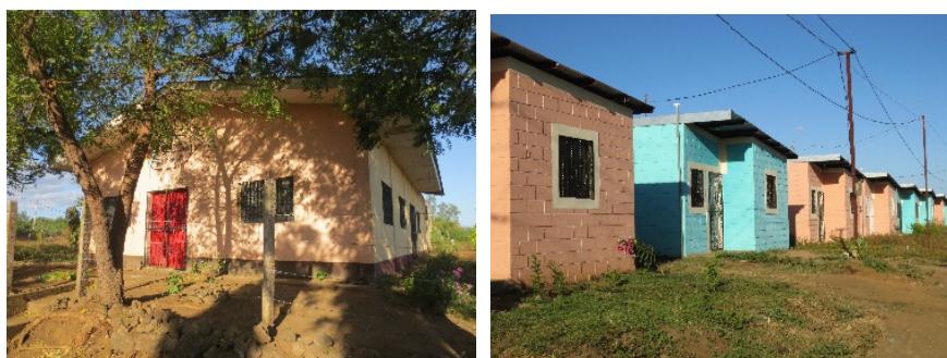
Figure 5. Community center and houses built by Manos Amigas, a housing cooperative, in León, Nicaragua.

The housing cooperative, Manos Amigas, has 20 members and is located in the Southeast district of León. Manos Amigas officially became a housing cooperative in 2008. The houses were built in 2016. The cooperative faced various difficulties in obtaining public finance for housing, but they eventually obtained a loan from a private fund. A CTC was built adjacent to the houses and used a central place for housing construction (see Figure 5). This CTC was used by other housing cooperatives in the district as well. The CTC also provided a space for activities by other groups in the neighborhood as a center for the wider community. In the southeast district of León, two other housing cooperatives had constructed homes with the help of the CTC, and six other cooperatives were established prepared to build homes. Following this CTC model, another was built in the nearby housing cooperative Juntando Manos. We Effect, a Swedish NGO, and Foundation Juan XXIII, a Spanish NGO, provided loan aid to these housing cooperatives [6].