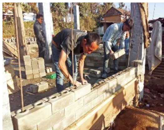
Figure 4. Reconstruction of houses in Dandagaun.