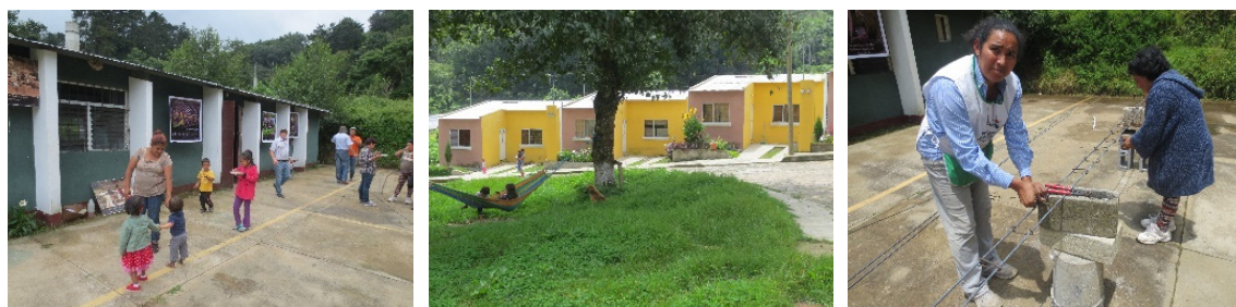
Figure 6. Community center, family houses, and production of blocks in Fe y Esperanza, a housing cooperative, Guatemala.

The cooperative Fe y Esperanza is located in San Pedro, near Guatemala City, in a rural area engaging in horticulture. The first group of families formed the pre-cooperative in 2004. That same year, land was acquired through a loan provided by three aid agencies, namely Institute of Socio-Economic Development in Central America (IDESAC) from Guatemala, and two international ones. The CTC was built in 2008. They then worked on the site to construct the access road before the first houses were built in 2010. In 2016, nine houses were available and three were being built. The members of the cooperative and an architect from the IDESAC designed an urban subdivision plan. Later, a standard dwelling was designed (see Figure 6).