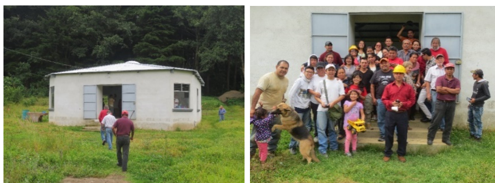
Figure 7. Community center and members of Domus Magistri, a housing cooperative, Guatemala.

The cooperative Domus Magistri in Santiago, outside Guatemala City, began working together in 2006. The founding members were mainly teachers. In 2016, only one of the founders was still in the cooperative. In 2008, the cooperative received the status of a legal person. All members of the cooperative worked in Guatemala City and in 2016, they had to continue living there because they had not yet built their houses. However, the cooperative already had ownership over the land, and built its CTC to host workshops and to store building materials (see Figure 7). It also has made an urban design and designs for the individual houses. The situation in Guatemala in 2016 revealed difficulties in obtaining state subsidies for the housing project.