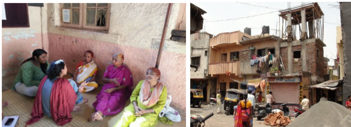
Figure 2. Meeting accommodations and incremental housing construction in Pune.