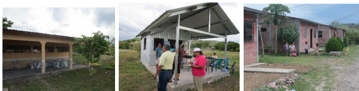
Figure 8. Community hall, community kitchen, and houses in Covisenacal, a housing cooperative, Honduras.