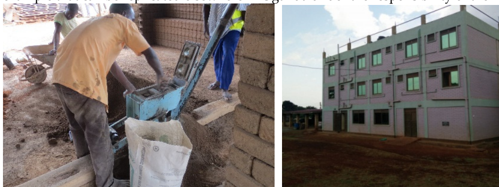
Figure 3. Production of compressed earth blocks in the Jinja Training Center and Hostel for trainees.

trainees, and the CTC for the Walukuba community were entirely constructed from materials produced on site. Demonstration projects such as sanitation units and a demo house are also available. The project is managed and partly funded by the NSDFU. The key stakeholders are ACTogether, the Jinja Municipality, and the Slum Dwellers International (SDI). The CTC is an example that can be replicated elsewhere in Uganda under the responsibility of the NSDFU.