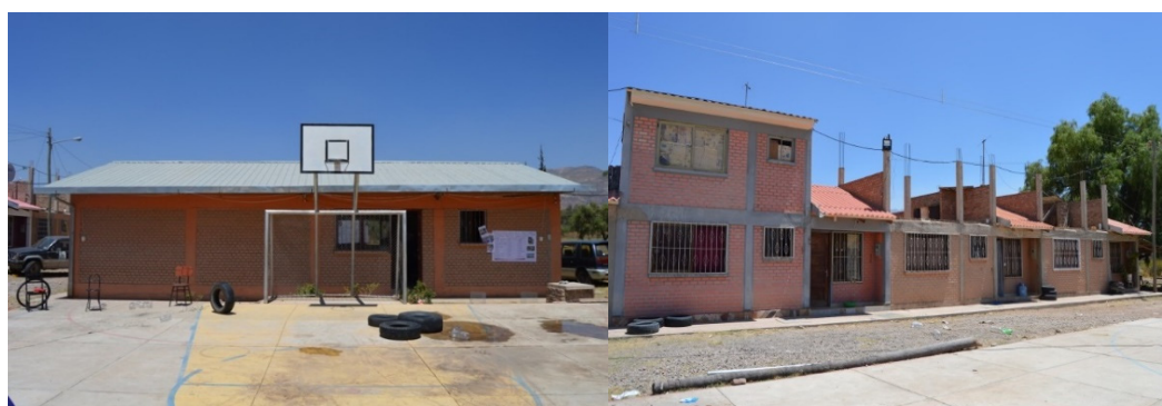
Figure 10. Community center and incremental housing in Virgen del Rosario, a housing cooperative, Bolivia.