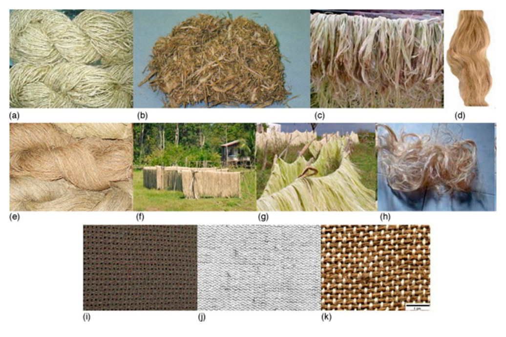
Figure 3. Natural plant Fibres ( a ) Banana; ( b ) sugarcane bagasse; ( c ) curauá; ( d ) flax; ( e ) hemp; ( f ) jute; ( g ) sisal; ( h ) kenaf; ( i ) Jute fabric; ( j ) ramie ( k ) jute [31].