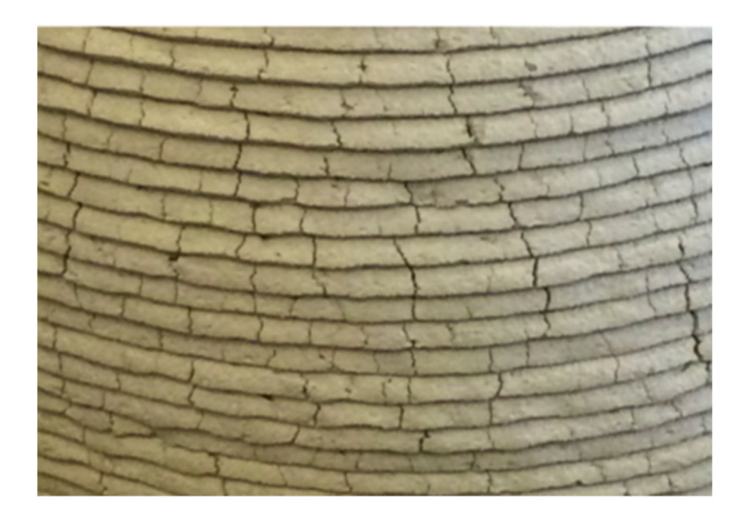
Figure 2. Excessive shrinkage cracking in an early showcase 3D printing mortar element [23].

However, the material selection and mix design are the critical limiting factor in 3D printing in concrete. In 3D printing concrete specific mixture, which is denser than the typical concrete, without coarse aggregates, steel reinforcement has to be used. Additionally, the mix design of concrete ought to meet the performance requirements of both structural and fire resistance of concrete [23]. Many mix designs have been proposed by past researches [24–29]. However, it was recognized that the mixture with retarders and accelerators, which was used to modify the setting time, showed very high shrinkage and the problem was solved with the inclusion of micro polypropylene (PP) fibres [30]. Figure 2 shows an example of an early showcase of 3D printed concrete (3DPC) structural element with shrinkage cracking. Therefore, researchers incorporated artificial fibres into the printable concrete mixture to increase the tensile properties while overcoming drying shrinkage and cracking problems. However, limited studies have been conducted on the effect of fibre incorporation in 3DPC to date. Hence, the use of such renewable material in 3DPC will potentially help for a sustainable development of 3D printing technology in the building and construction industry.