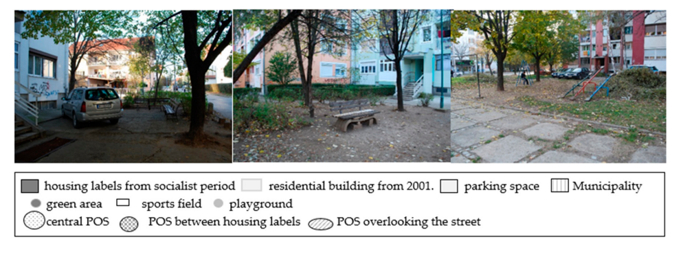
Figure 3. Analysis of a section of the Durlan housing area.

Site plan analysis-based on General Regulation Plan of Pantelej municipality from 2012 & Pantelej Municipality, Cadastral Parcels