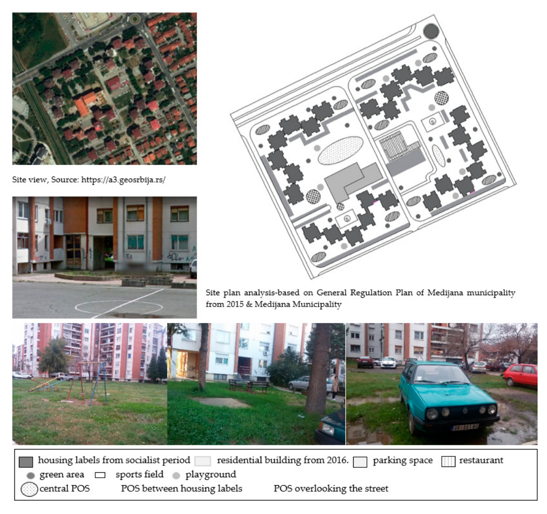
Figure 2. Analysis of a section of the Krivi Vir housing area.

Environmental comfort of POSs is at a low level, as identified in Table 2 and stated by 74.71% of the residents. The reasons varied and included disorganized waste disposal areas, irregular maintenance of hygiene, and unmaintained green spaces—as confirmed by the survey: 50.98% of the residents thought that there were not enough green spaces and 81.25% were very dissatisfied with how they were maintained. Even though POS maintenance and regeneration are the duty of PUCs "Medijana" and "Gorica", the area has seen little activity from these companies. Maintenance of hygiene, green spaces, and street furniture is at a very low level. The reasons for reduced environmental comfort should also be sought in the construction of the new apartment building: a previously vacant space, which could have been converted into a mini park for the residents, was put to more profitable use.