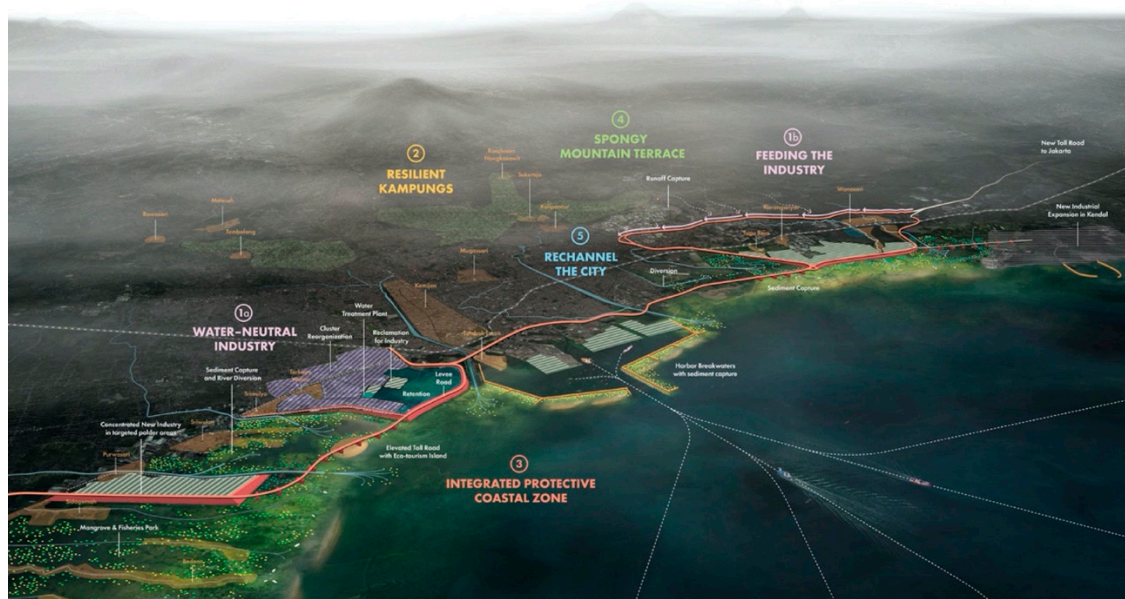
Figure 1. Conceptual design of the climate resilience proposals developed in the Water as Leverage program in Semarang (Source: Water as Leverage 2019—image produced by the two design teams One Resilient Semarang and Cascading Semarang).