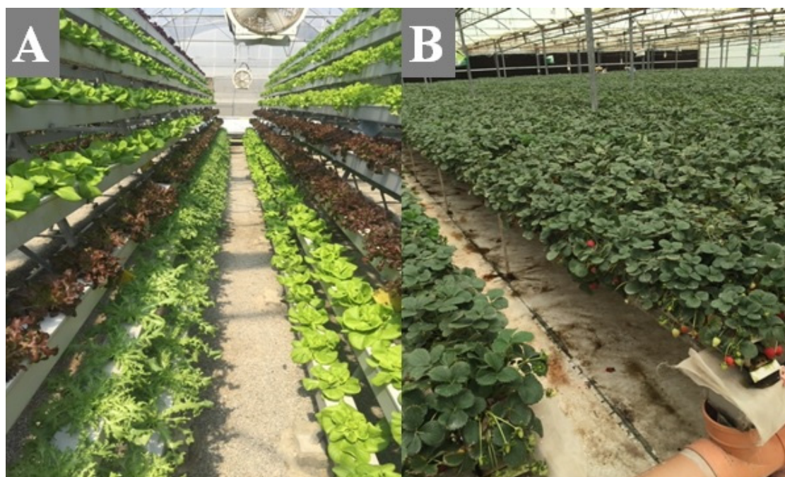
Figure 3. The successful cultivation of lettuce (A) and strawberry (B) in Muscat, Oman under hydroponic systems.

Hydroponics is a cultivation method that does not require soil, but relies on nutrient enriched water. Roots are either suspended in water or supported by growth media such as rocks, clay, or pebbles [117]. Sunlight can be supplemented or replaced with lighting structures that supply light, usually light emitting diode (LED) lights. It is carried out in a controlled temperature environment, so that reduced chemical or chemical-free fresh produce will be available to urban areas year-round. It is the most adopted technology in countries that are not able to grow food during the winter. In hydroponics, all ecological factors like relative humidity and temperature are automatically controlled. This also reduces the risk of harmful insects, pests, and disease causing microorganisms [118,119]. Moreover, the product produced under hydroponic systems is dirt-free and free from animal excreta. This system has several advantages over traditional soil culture as it requires less maintenance, weeding, and tilling [120]. Further, it is a labor- and time-saving technology to manage larger areas of production, as nutrients and pH are easily manageable under this system [121]. Therefore, under ideal environmental conditions, and nutrients availability, the products produced under hydroponics are uniform and high yield (Figure 3). Hydroponics is an important alternative planting practice of growing fruit and vegetable in urban areas where fertile land is limited.